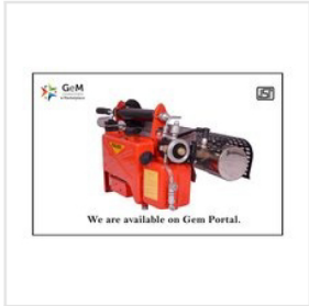
Manual Fogging Machine