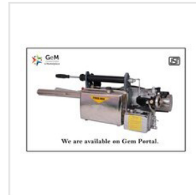
Heavy Duty Fogger