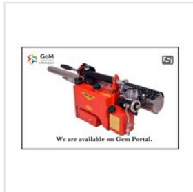
Heavy Duty Thermal Fogging Machine