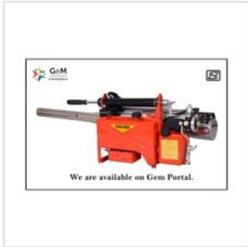
Disinfectant Thermal Fogging Machine