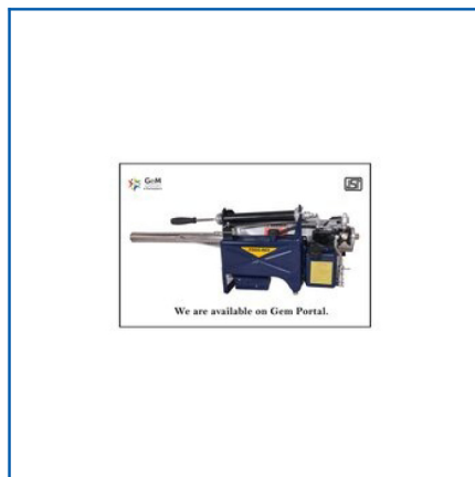
PORTABLE FOGGING MACHINE