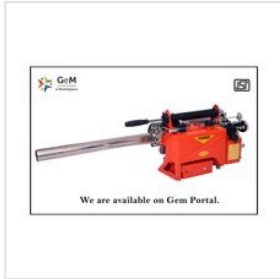
Heavy Duty Fog Machine