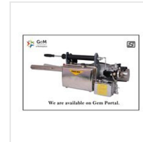
Medium Duty Fogging Machine