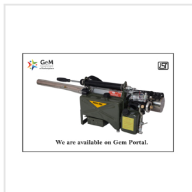
Mosquito Killing Thermal Fogging Machine