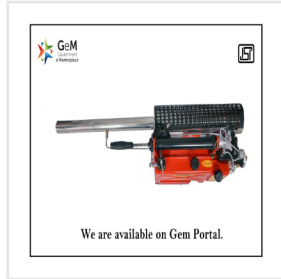
Made In India Thermal Fogging Machine