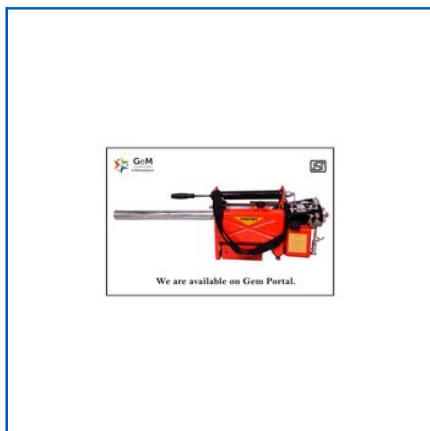
THERMAL FOGGING MACHINE