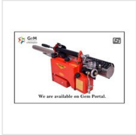
Thermal Fogging Device