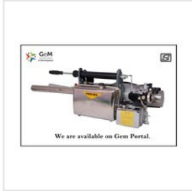
Heavy Duty Fogging Machine