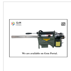
Medium Duty Fogger