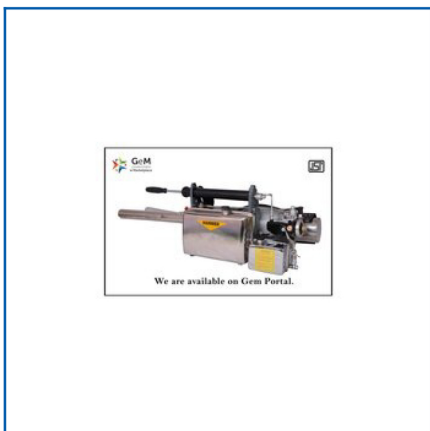
GARDEN THERMAL FOGGER

100 Ltr Vehicle Mounted Thermal Fogging Machine, 150 Ltr Vehicle Mounted Thermal Fogging Machine, 35 Ltr Vehicle Mounted Thermal Fogging Machine, 360 rotator for ULV Fogger, 50 Ltr Vehicle Mounted Thermal Fogging Machine, 70 Ltr Vehicle Mounted Thermal Fogging Machine, Auto Start Thermal Fogging Machine, Auto mounted Vehicle mounted machine, etc.