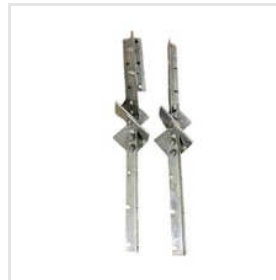
Anti Climbing Device