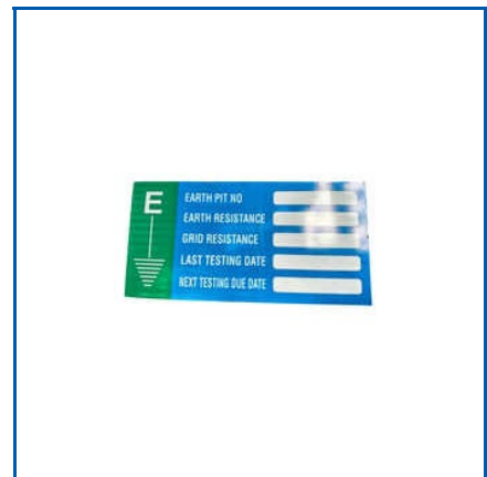
EARTHING PIT PLATE