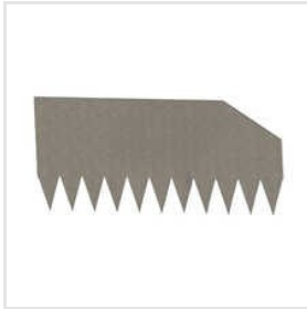
PVC Bird Guard For Electrical