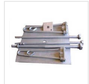
Electric Stay Set