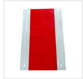
Red Reflector Plate For Oman