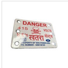
Danger Sign Plate