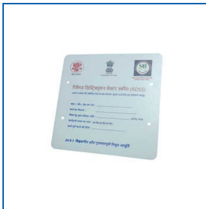
VILLAGE SIGN BOARD