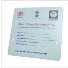
Village Sign Board