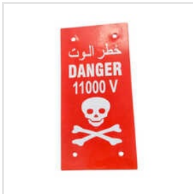
11KV Sign Plate