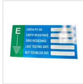
Earthing Pit Plate