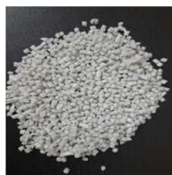
PPCP EQUAL TO B120MA OF RIL