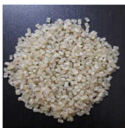
PP NATURAL POLYMER

ABS Black Granules, ABS Glass filled, ABS Granules, ABS Parker white, Black Masterbatches, HDPE Black, HDPE Blue Drum Granules, Konnichiwa Color MB, LDPE Natural, LG ABS, Nylon 6 Glass filled, Optical brightner MB, PBT Granules, PC Makrolon, PP Black Granules, etc.