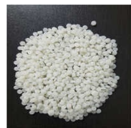
PPCP GOL DANA