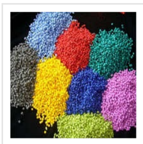
Konnichiwa Color MB