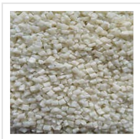
ABS Glass Filled