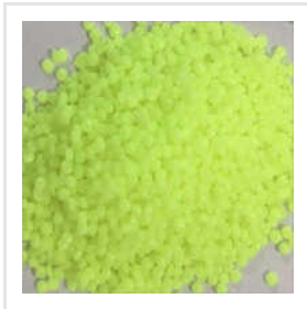
Optical Brightner MB