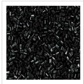
ABS Black Granules