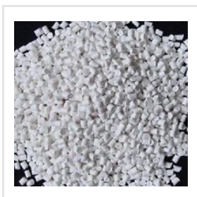
PP FR V0 COMPOUND