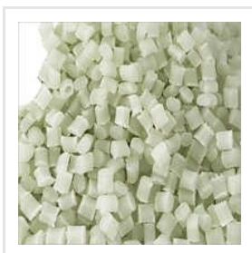
Nylon 6 Glass Filled