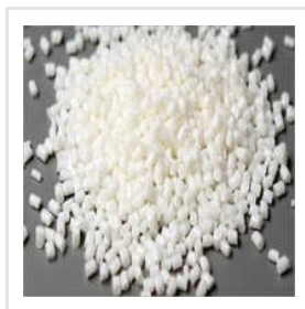
PP Glass Filled