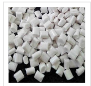
ABS Parker White