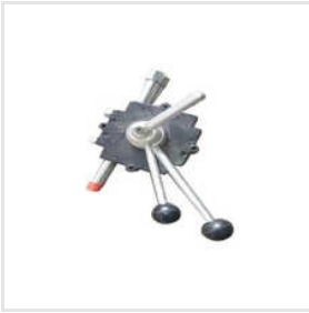
Transit Mixer Lever Box