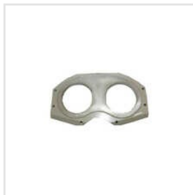
Spectacle Wear Plate