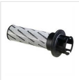
Transit Mixer Hydraulic Oil Filter