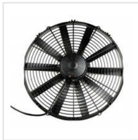
TM Fan Asst