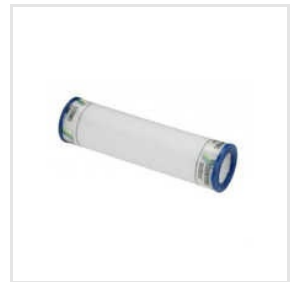
Boom Pump Filter