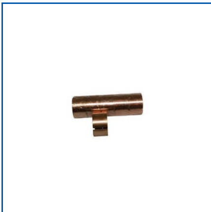
BOOM PUMP BUSH FOR PM

160-60 Concrete Pump Hydraulic Cylinder, 24V 12 Inch Boom Pump Fan, 258034006 Torque Support, 4 by 3 Way Valve, 426793 Putzmeister Wedge, 445777 Concrete Pump Seal, 500-750 Concrete Pump Agitator Motor, Auxiliary Groove, Ball Cup Concrete Pump Spare Parts, Boom Hydraulic Cylinder Seals Set, Boom Pump Bush For PM, Boom Pump Cylinder Seals Kit, Boom Pump Filter, Boom Pump Hydraulic Cylinder Seals Set, Boom Pump Perforated Filter, etc.