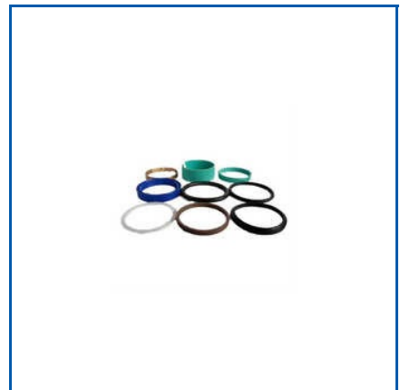
PLUNGER HYDRAULIC CYLINDER SEALS SET