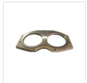
DN230 Spectacle Wear Plate