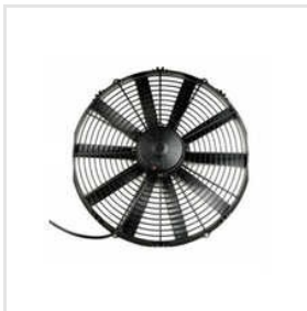
24V 12 Inch Boom Pump Fan