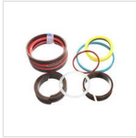
Boom Pump Cylinder Seals Kit