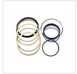
Boom Hydraulic Cylinder Seals Set