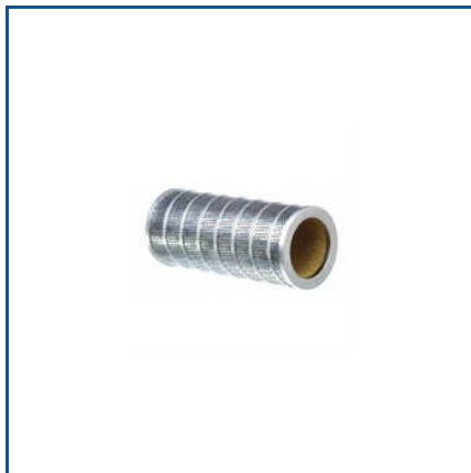
BOOM PUMP PERFORATED FILTER