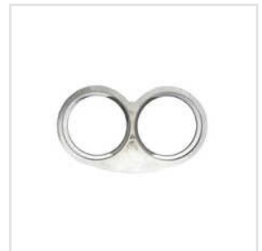
Truck Concrete Spectacle Wear Plate