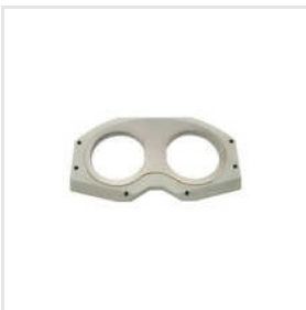
DN200 229488005 Spectacle Plate