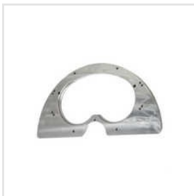
Schwing Base Plate