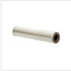
Boom Pump Filter