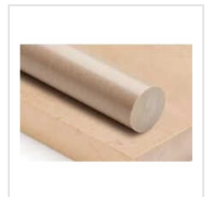
PEEK Sheet Medical (Bio-Compatible)