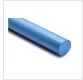
PEEK Rod -10% PTFE Filled