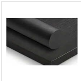
X-RAY Opaque BioCompatible PPSU