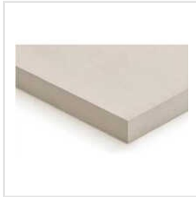
X-RAY Detectable BioCompatible PEEK