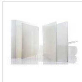
PFA (Per Fluoroalkoxy Alkane)