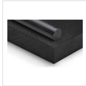
PVDF ELS Black (Modified -Carbon