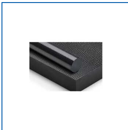
PEEK ESD- BLACK