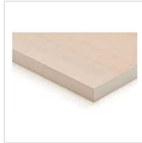
PEEK Sheet - Ceramic Filled