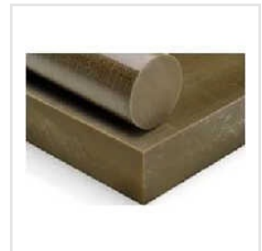
PEI (PolyEtherImide) Glass Filled 30% (GF30)