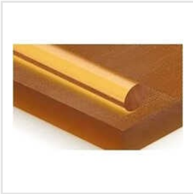
PES (Poly Ether Sulfone)