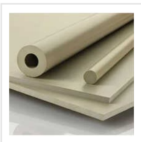
PEEK (Unfilled -100% Virgin)