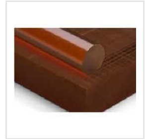
PEI (PolyEtherImide) Unfilled