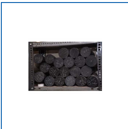
NYLON MOS2 ROD

100m Brown PTFE Fiber Glass Cloth, 4 MM Polypropylene Sheet, 4mm Polypropylene Sheet, ABS (Acrylonitrile Butadiene Styrene), Acrylic Sheet- Rod- Clear- Transparent, Acrylic Tube- Clear- Transparent, Bakelite Brown Rod, Bakelite Rod, Bakelite Sheet, Brown PTFE Fiber Glass Cloth, Cast Nylon Rod, Cast Nylon Sheet, Detectable FOOD GRADE PBT Polyester, ECTFE (Ethylene Chloro Tri Fluoro Ethylene), Electrically Active POM-C With Carbon Black Filler ESD, etc.