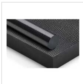
PEEK Modified - Filled With 10% Carbon 10%