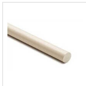
PEEK Rod Medical White