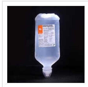
Compound Sodium Lactate Injection