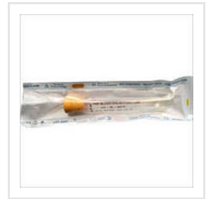
8 ML Bio Pro PRP ACD-Gel Biotin Vacuum