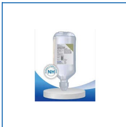
SODIUM CHLORIDE INJECTION