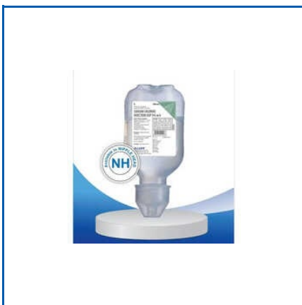
100ML SODIUM CHLORIDE INJECTION

10 ML Bio Pro PRP ACD Gel Vacuum Tube, 10 ML PRP Tube Acd Gel Biotin, 100ml Sodium Chloride Injection, 500 ML Sodium Chloride Injection, 500ml Sodium Chloride Dextrose Injection, 600 MG Glutathione Injection, 8 ML Bio Pro PRP ACD-Gel Biotin Vacuum Tube, 8 ML Bio Pro PRP ACD-Gel Vacuum Tube, Anti Hair Fall Tablets, Ascorbic Acid Injection, Bevacizumab Injection, Blood Bags, Blood Collection Bag, Blood Collection Bag System, Compound Sodium Lactate Injection, etc.