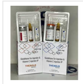
Glutathione Whitening Injection