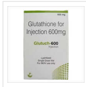
600 MG Glutathione Injection