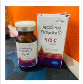
Ascorbic Acid Injection