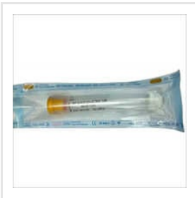
10 ML Bio Pro PRP ACD Gel Vacuum Tube