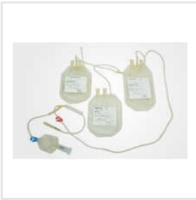
Blood Collection Bag