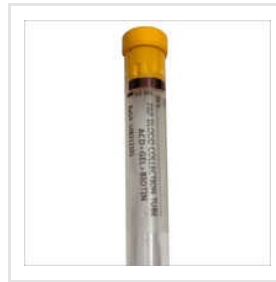
10 ML PRP Tube Acd Gel Biotin