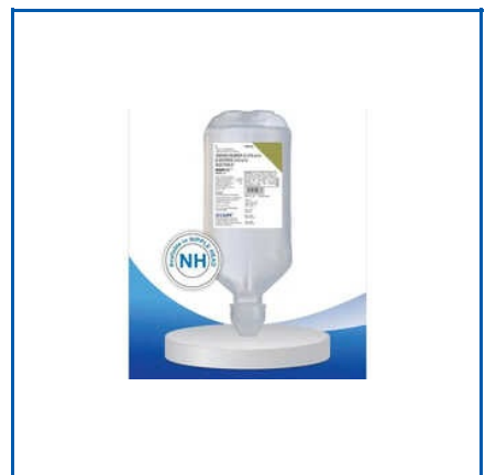
500ML SODIUM CHLORIDE DEXTROSE INJECTION