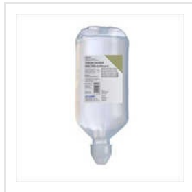
500 ML Sodium Chloride Injection