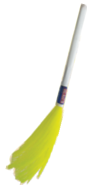
HIGH LOOK BROOM