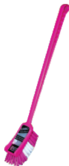
JUMBO TOILET BRUSH