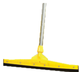
SUPER MAID WIPER