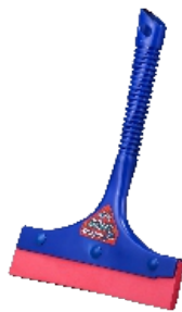
KIWI KITCHEN WIPER