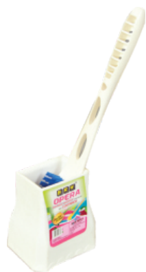
OPERA D/H WITH CONTAINER