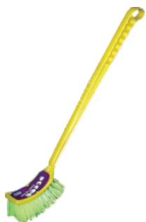
DECOR TOILET BRUSH