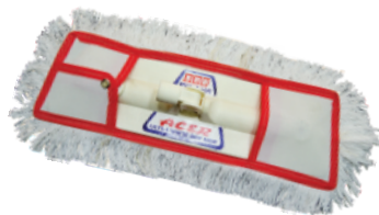
ACER DRY MOP