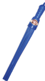
KIT KAT BROOM