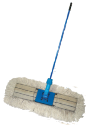
DRY CLEAN MOP 18" & 24"