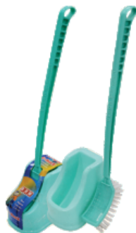
U-ROXX TOILET BRUSH CONTAINER