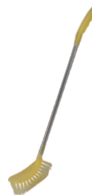
STEEL KLEENO T/BRUSH