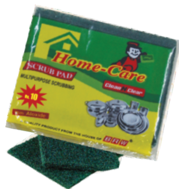
HOME CARE SCRUB PAD 10/-