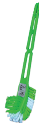
BOLD & BEAUTIFUL D/H