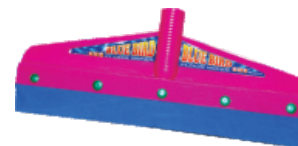
BLUE BIRD WITH PVC ROD