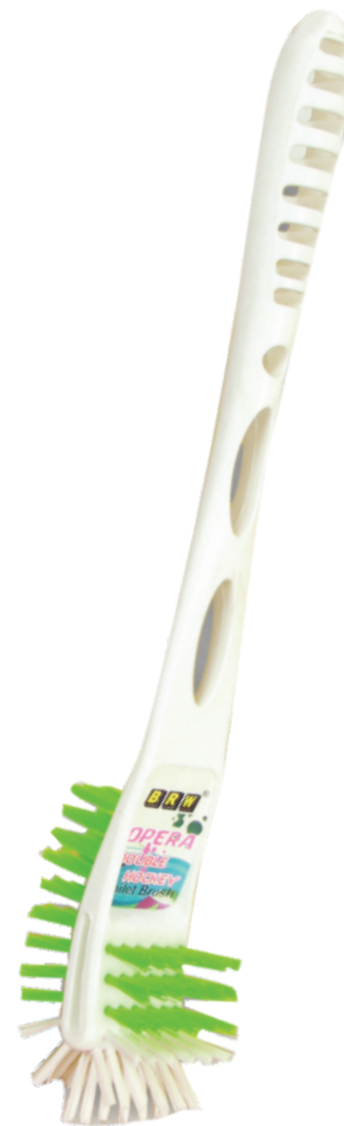
OPERA DOUBLE HOCKEY