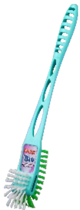
BIO DOUBLE HOCKEY