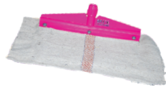
BRITE WITH CLOTH WIPER