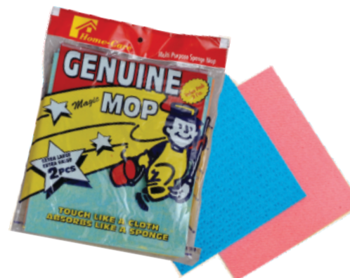
GENUINE MOP 2 PCS