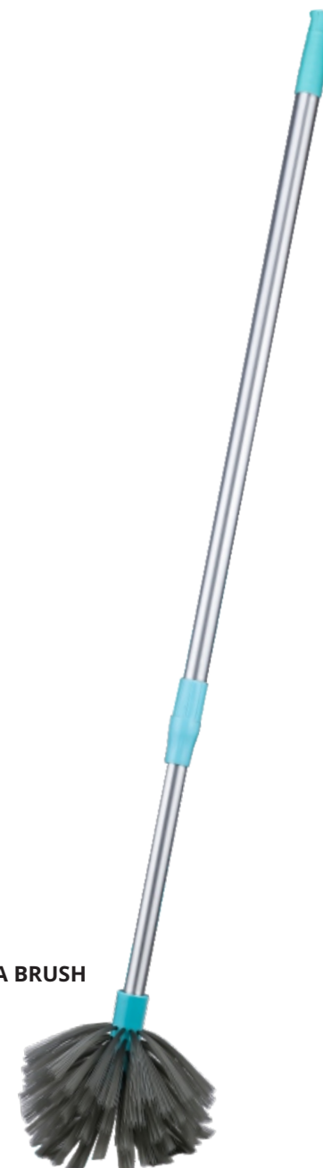
ROUND JALA BRUSH