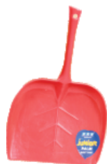
JUNIOR PALM DUST PAN