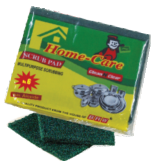
HOME CARE SCRUB PAD 6/-