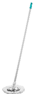
STEEL CHAKRI MOP