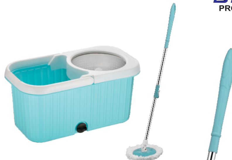
SPIN MOP PLASTIC