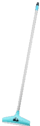
ACE-W 12" WIPER