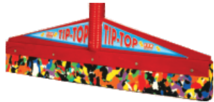
TIP TOP WIPER