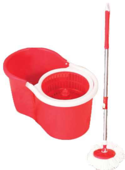
MAGIC MOP PLASTIC