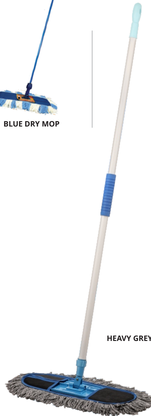
HEAVY GREY DRY CLEAN MOP 18" & 24"