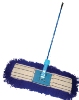
BLUE DRY CLEAN MOP 18" & 24"