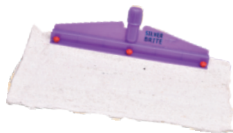
SILVER BRITE WITH CLOTH WIPER