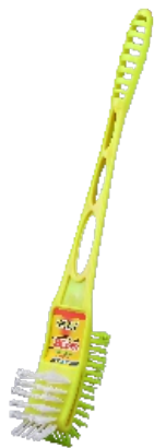
BOSS DOUBLE HOCKEY