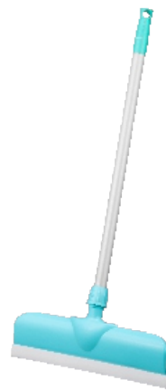
TPR 13" WIPER