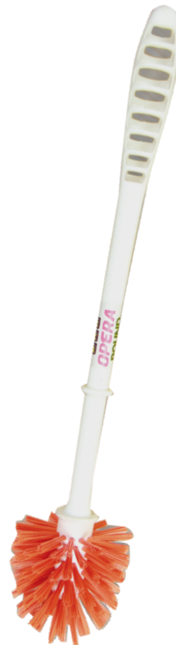
OPERA ROUND T/BRUSH