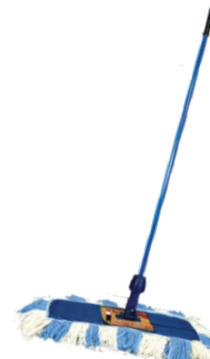
BLUE DRY MOP