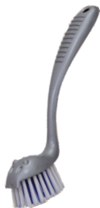
MICKEY MOUSE S/BRUSH