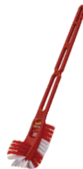
NU LOOK DOUBLE HOCKEY