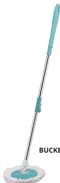
BUCKET MOP ROD SET