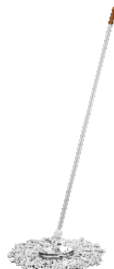
STEEL CHAKRI MOP COTTON THREAD