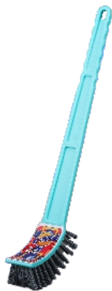
TUBIG TOILET BRUSH