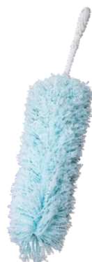
ROUND MICRO DUSTER