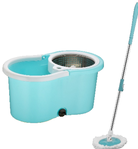
MAGIC MOP STEEL