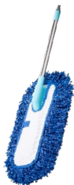
LONG CAR DUSTER