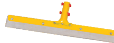
COMMANDO 23" WIPER