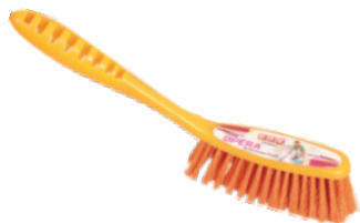
OPERA CARPET BRUSH