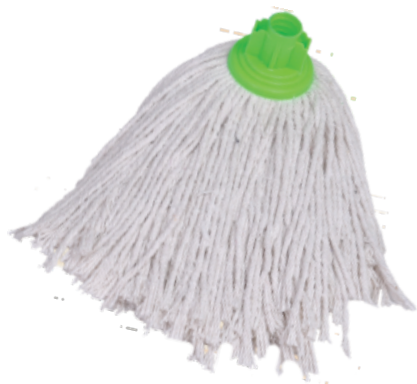
U K MOP