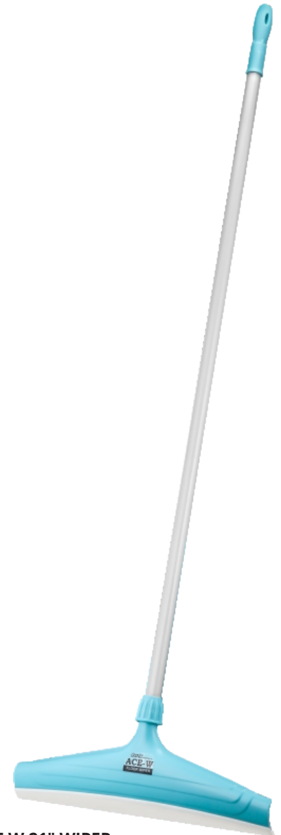
ACE W 21" WIPER