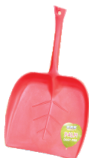
PALM DUST PAN