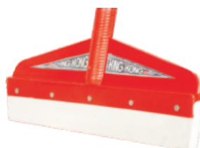
KING KONG WIPER