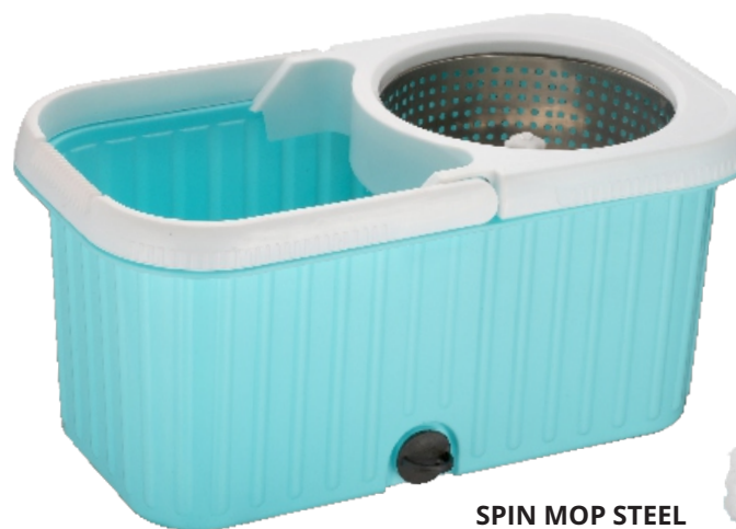
SPIN MOP STEEL