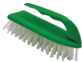
HARDY CLOTH BRUSH