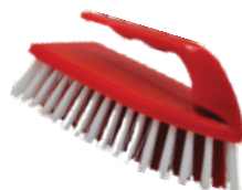
SOFTY CLOTH BRUSH