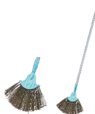
DIAMOND JALA BRUSH