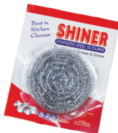
SHINER 25 GROSS SINGLE