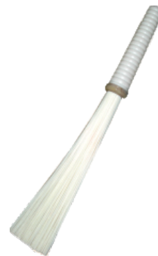
FIBER KHARATA BROOM