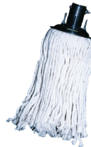
STEEL ROUND MOP