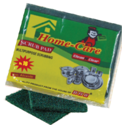
HOME CARE SCRUB PAD 16/-