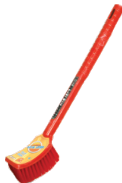
RICH LOOK T/BRUSH