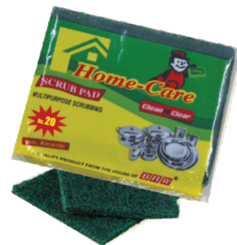
HOME CARE SCRUB PAD 20/-