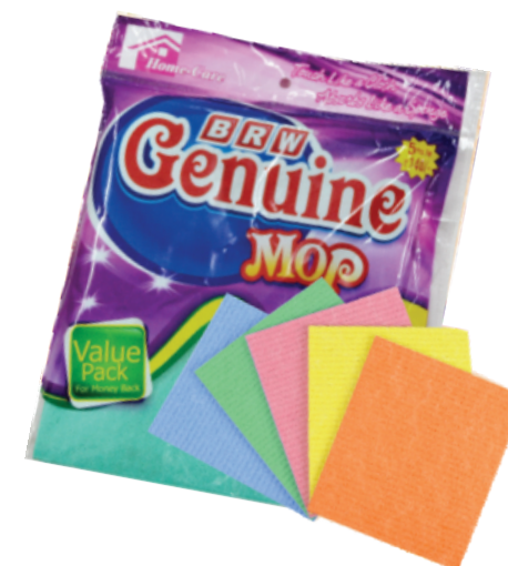
GENUINE MOP 5 PCS