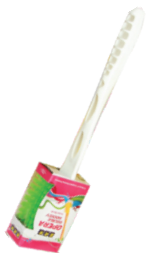
OPERA DOUBLE HOCKEY