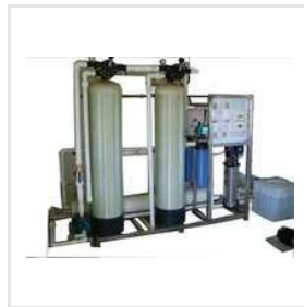
Reverse Osmosis Water Filter System