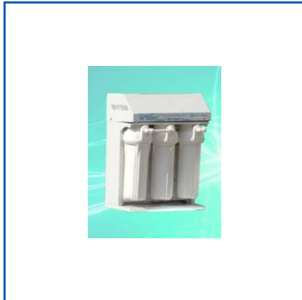
DOMESTIC RO SYSTEM