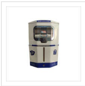
Domestic RO Water Purifier