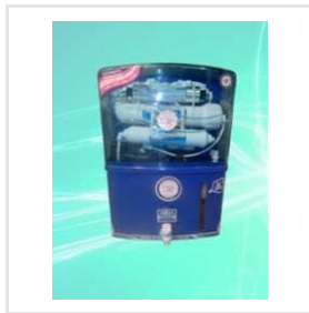
Home Water Filter Purifier