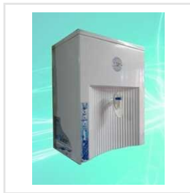
P-Top Model Water Purifier