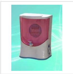
Oxen Aries RO Model Water Purifier