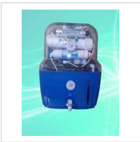
UV Water Purifier