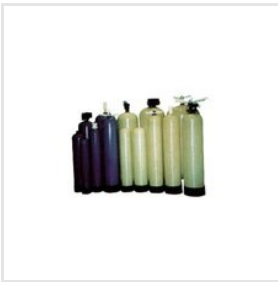
Water Softener Pressure Vessel