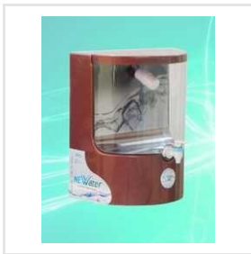
Domestic RO Water Purifier