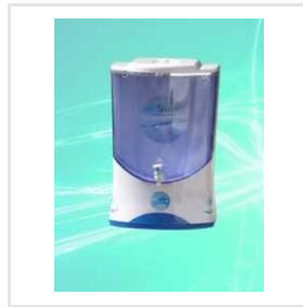
Aqua Guard Water Purifier