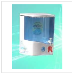
RO Water Purifier