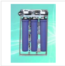
Domestic RO Filter