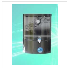
Expert Water Purifier