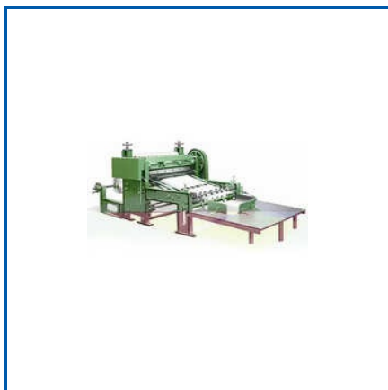
HEAVY DUTY AUTOMATIC PAPER REEL TO SHEET CUTTING MACHINE