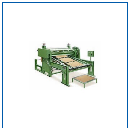
HEAVY DUTY AUTOMATIC PAPER REEL TO SHEET CUTTING MACHINE FOR CORRUGATION