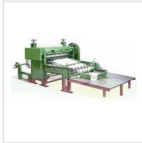
Heavy Duty Automatic Paper Reel To Sheet