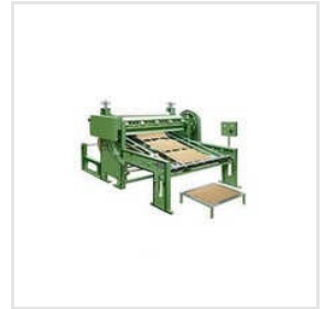
Non Woven Roll Cutting Machine