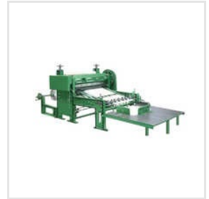
Servo Precision Rotary Paper Cut To Length