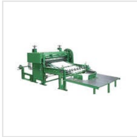
Semi Automatic Paper Cutting Machine