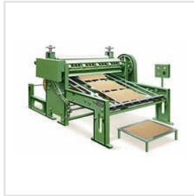
High Speed Rotary Corrugated Sheet