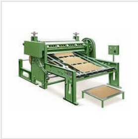
High Speed Rotary Cutting Machine For