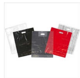
ALUMINIUM FOIL POUCH