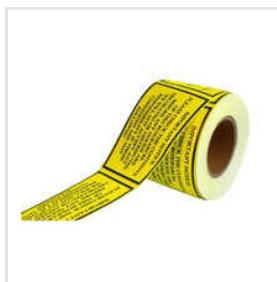
Glassin Poly Rolls