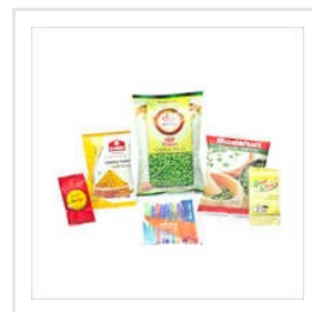
Printed Center Seal Pouches