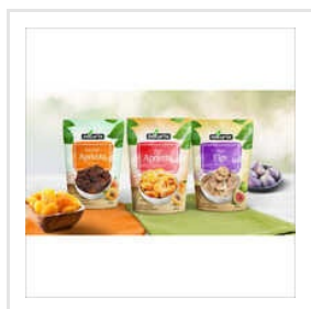
Printed Stand Up Pouches