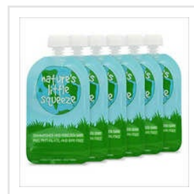
Printed Reusable Pouches