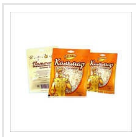
Printed 3 Side Seal Pouches