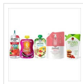
Printed Patch Handle Bags