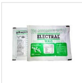
4 Ply Aluminium Foil