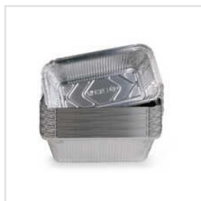
Disposable Aluminum Foil Containers