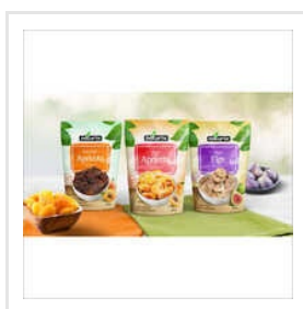
Printed Zipper Pouches