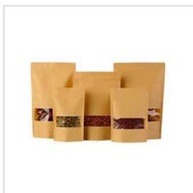
Paper Pouch Bag