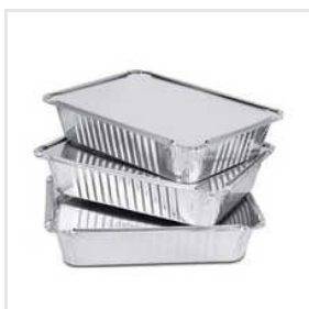
Disposable Aluminum Foil Containers