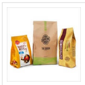
Printed Gusseted Pouches