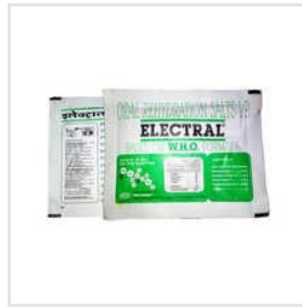
4 Ply Aluminium Foil