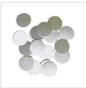
Induction Sealing Wads