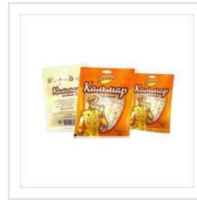
Printed Three Side Seal Pouches