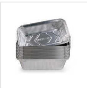
Disposable Aluminum Foil Containers