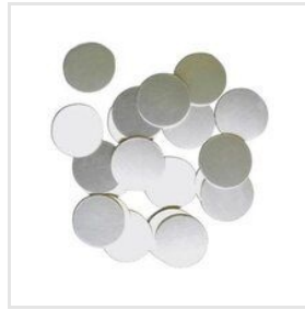
EPE Liner Wads