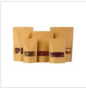
Paper Pouch Bag