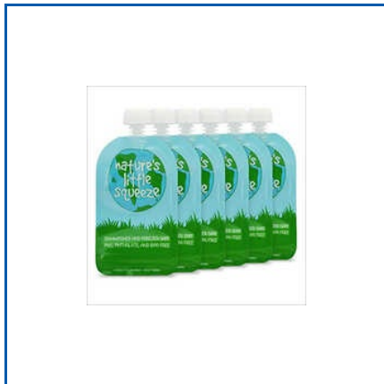
PRINTED REUSABLE POUCHES