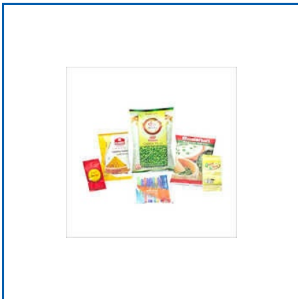
PRINTED CENTER SEAL POUCHES

4 Ply Aluminium Foil, Aluminium Foil Pouch, Coated Plain - Printed Aluminium Foil, Disposable Aluminum Foil Containers, EPE Liner Wads, Food Packing Paper Rolls, Glassin Poly Rolls, Induction Sealing Wads, Induction Wads, LID Foil, Paper Pouch Bag, Printed Center Seal Pouches, Printed Gusseted Pouches, Printed Patch Handle Bags, Printed Pouch, etc.