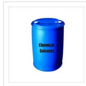
Chemical Mixed Solvent