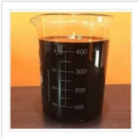
LDO Light Diesel Oil