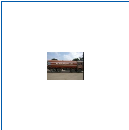
BITUMENS V G 30