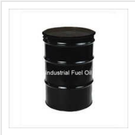
Industrial Fuel Oil