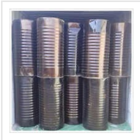
Bitumen VG 30