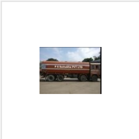
Bitumens V G 30