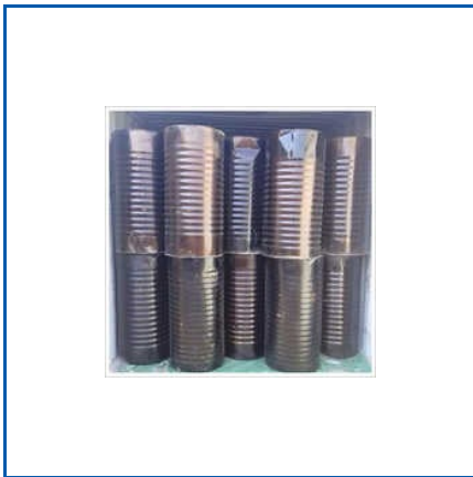
BITUMEN VG 30

Bitumen VG 30, Bitumens V G 30, Chemical Mixed Solvent, Chemical Tolvin, Ethyl Acetate Liquid, Furnace Oil, Industrial Fuel Oil, LDO Light Diesel Oil, Light Green Diesel Oil, Light Diesel Oil, Tyre Pyrolysis Oil, etc.