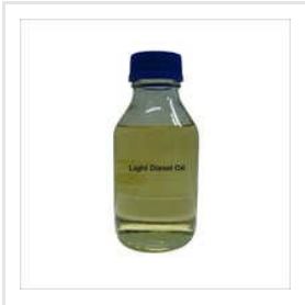
Light Diesel Oil