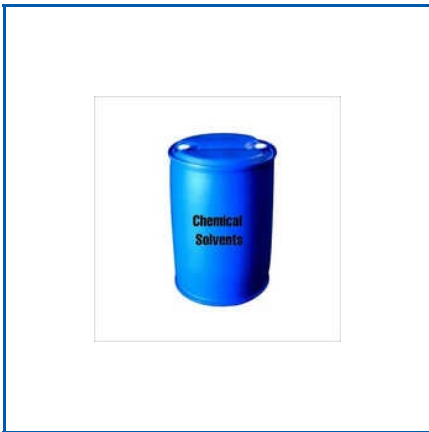
CHEMICAL MIXED SOLVENT