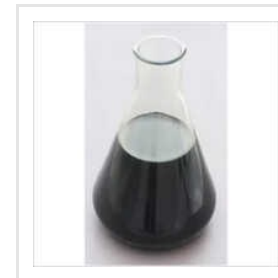
Tyre Pyrolysis Oil