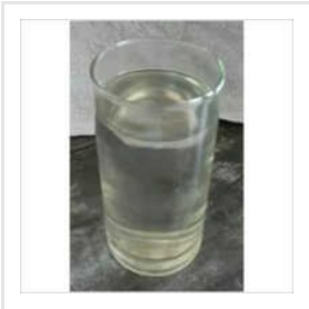
Ethyl Acetate Liquid