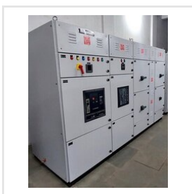
PCC Control Panel