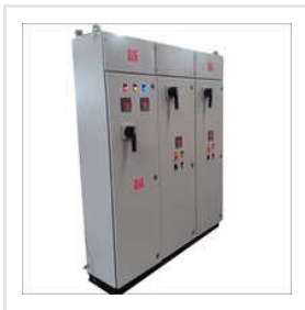
MULTI STAR-DELTA Control Panel