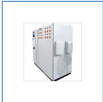
RTPFC CONTROL PANEL