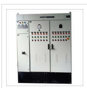
MCC With VFD Control Panel