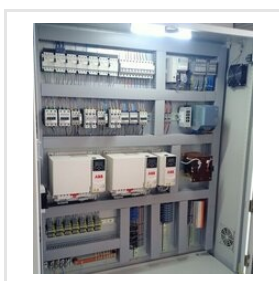
PLC Based MCC Panel