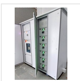
Solar ACDB Panel