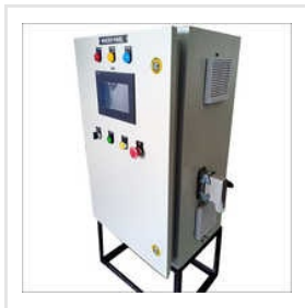
PLC WITH HMI Control Panel