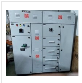
Power Distribution Panel