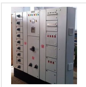
PCC With Changeover Control Panel