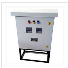
PDB Control Panel