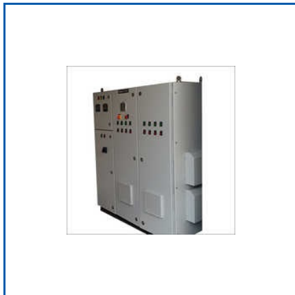
POWER FACTOR CORRECTION PANEL