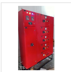
Fire Fighting Mcc Panel