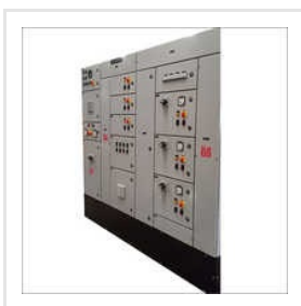
Mcc Control Panel