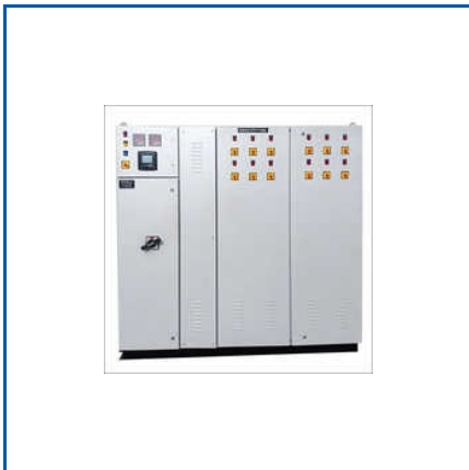
RTPFC CONTROL PANEL

Ac Drive Control Panels, Apfc Control Panel, Control Transformer, Db Panel, Dcs Application Mcc Control Panel, Electrical Vfd Control Panel, Fire Fighting Mcc Panel, Etc.