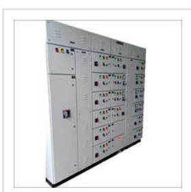
DCS Application MCC Control Panel