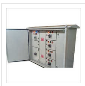
Solar Distribution Panel