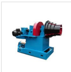
5 HP Step Type Decoiler