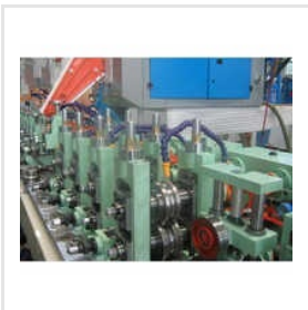
High Speed Tube Mill