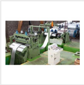
440W AC Slitting Line Machine