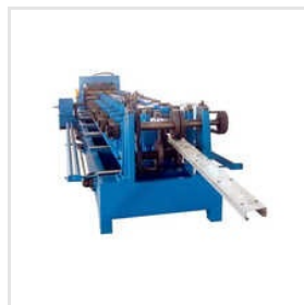
Automatic Sheet Roll Forming Machine