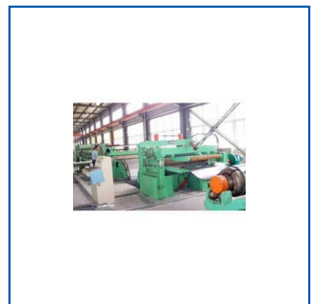
COIL SLITTING LINE MACHINE