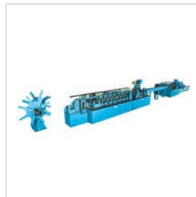
Stainless Steel Tube Mill