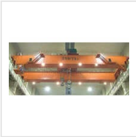
25 Ton Capacity Double Girder EOT