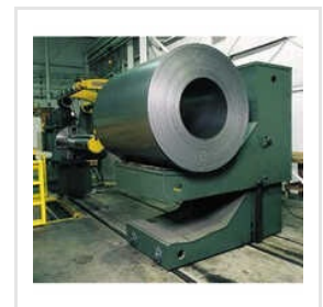
Electric Coil Unloading Car