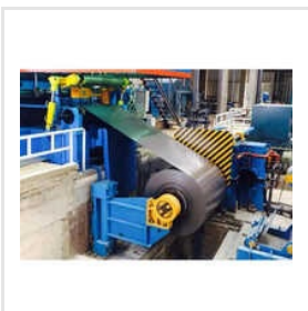
Automatic Cold Rolling Mill