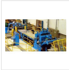
Automatic Slitting Line Machine