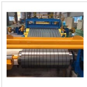
Automatic Metal Coil Slitting Line Machine