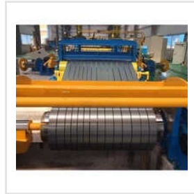
Metal Coil Slitting Line Machine