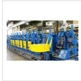
Carbon Steel Tube Mill