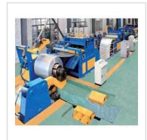
Automatic High Speed Cut Length Machine