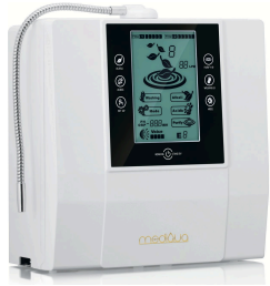
ALKALINE WATER IONIZER