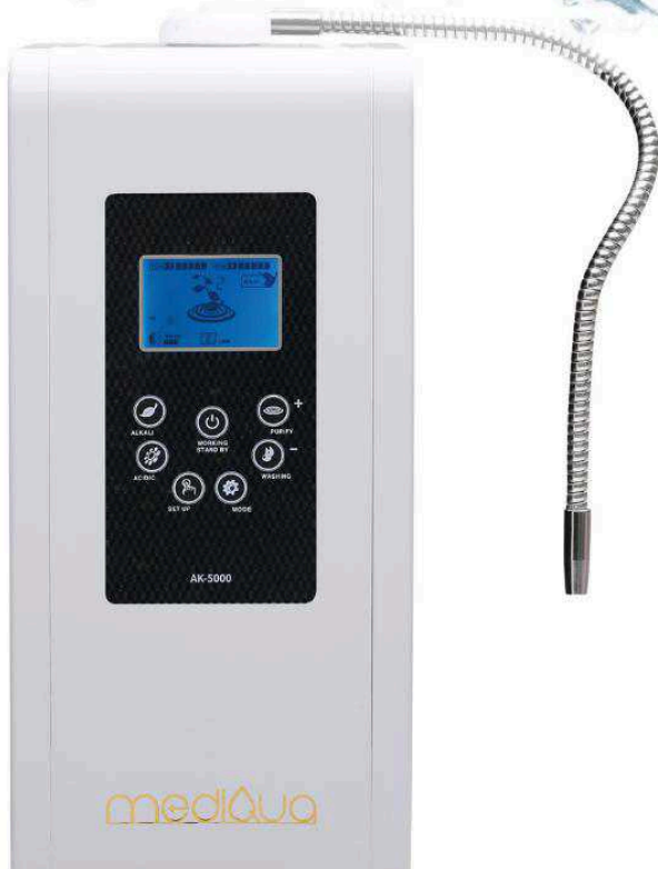
AK - 5000 In 5 Plates

Drink Alkaline and Hydrogen Water Together