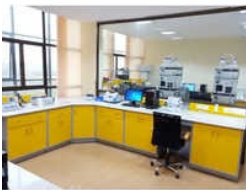
MS Lab Modular Cabinet