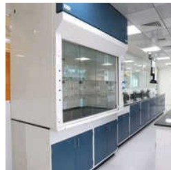
Laboratory Fume Hood