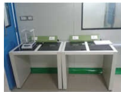
Anti Vibration Laboratory Table