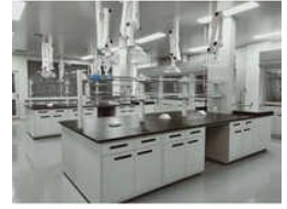
Lab Island Bench