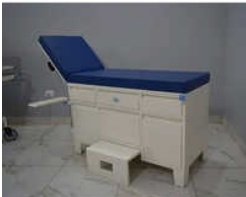
Examination Couch Bed