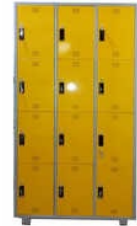
MS Staff Storage Unit