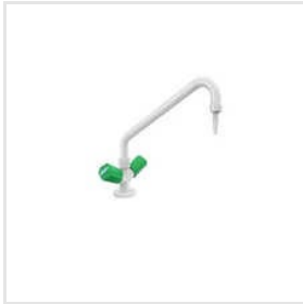
Laboratory Single Tap