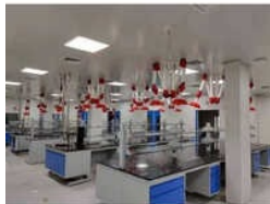
SS Laboratory Island Table