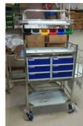
STAINLESS STEEL CRASH CART TROLLEY