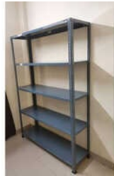
Industrial Slotted Angle Rack