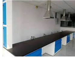
MS Laboratory Wall Table Cabinets