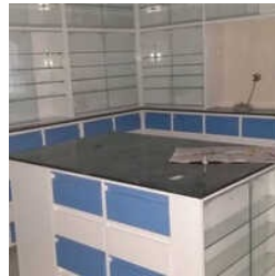
Wall Mounted Hospital Storage Racks