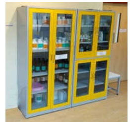
Chemical Storage Unit