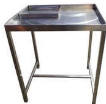
SS HOSPITAL SQUARE TABLE