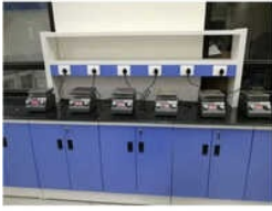
Lab Table With Reagent Rack