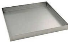
SS Hospital Tray