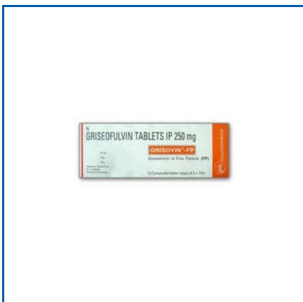
250MG GRISEOFULVIN TABLETS IP

10 Percent Minoxidil And Finasteride Topical Solution, 1000mg Valacyclovir Tablets USP, 100mg Doxycycline Capsules IP, 100mg Sitagliptin Phosphate Tablets IP, 10mg Lenalidomide Capsules, 12mg Ivermectin Tablets, 160mg Valsartan Tablets IP, 2 Percent Minoxidil And Aminexil Topical Solution, 200mcg Budesonide Inhalation IP, 200mcg Salbutamol Sulphate Rotocaps Capsule, 200mg Celecoxib Capsules, 200mg Tenofovir Disoproxil Fumarate And Emtricitabine Tablets IP, 250mg Azithromycin Tablets, 250mg Famciclovir Tablets, 250mg Griseofulvin Tablets IP, etc.