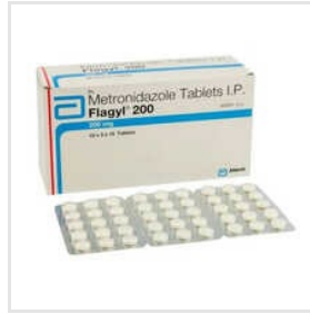
Metronidazole Tablets IP