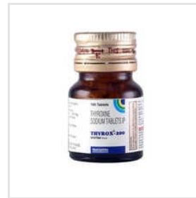
Thyroxine Sodium Tablets IP