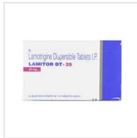
Lamotrigine Dispersible Tablets IP