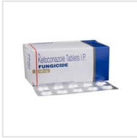
Ketoconazole Tablets IP