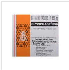
850mg Metformin Tablets IP