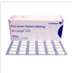
800mg Piracetam Tablets