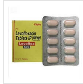
500mg Levofloxacin Tablets IP