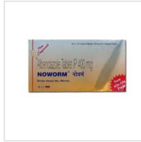
400mg Albendazole Tablets