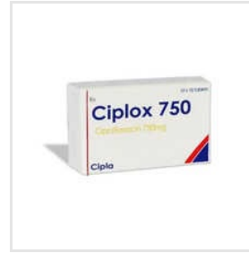
750mg Ciprofloxacin Tablets