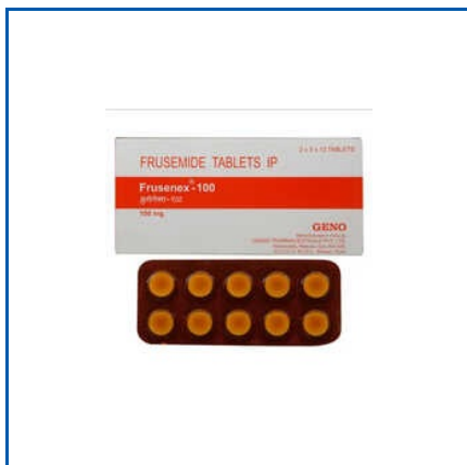
FRUSEMIDE TABLETS IP