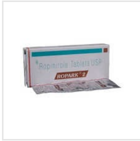
Ropinirole Tablets IP