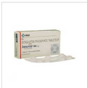
100mg Sitagliptin Phosphate Tablets IP