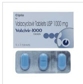
1000mg Valacyclovir Tablets USP