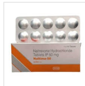
50mg Naltrexone Hydrochloride Tablets