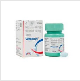
Sofosbuvir 400mg And Velpatasir 100mg