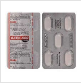
Azithromycin Tablets IP