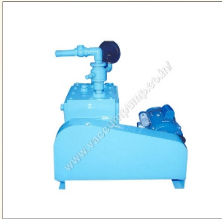
Centralized Vacuum System