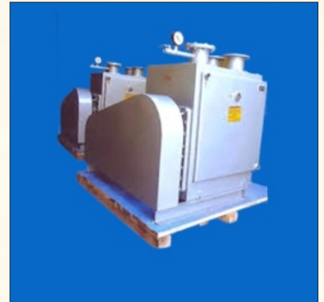
Oil Seal High Vacuum Pump