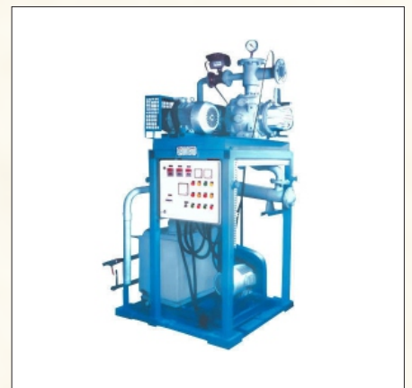
Single Stage Mechanical Vacuum Booster