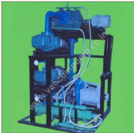
High Vacuum System