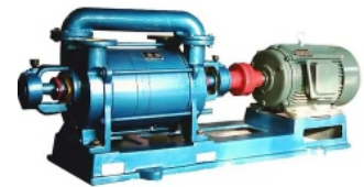
Direct Drive Vacuum Pump