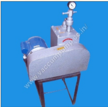
Duplex Vacuum System