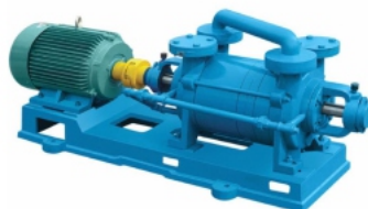
Two Stage Watering Vacuum Pump