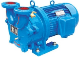
D Watering Vacuum Pump