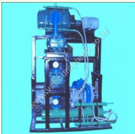
Industrial Vacuum Pump System