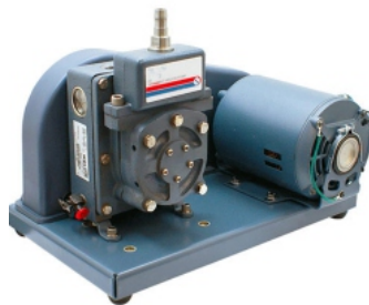
V- Belt Driven Vacuum Pump