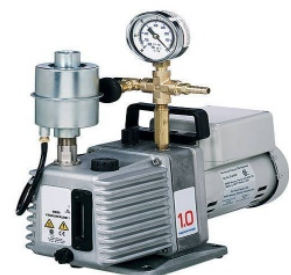
High Vacuum Pumps