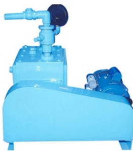
Double Stage Vacuum Pump