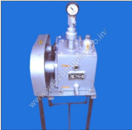
Pressure Vacuum System