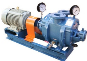
Liquid Ring Vacuum Pump