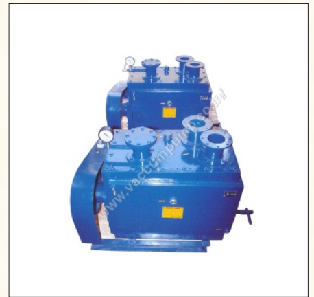
Standard Vacuum System