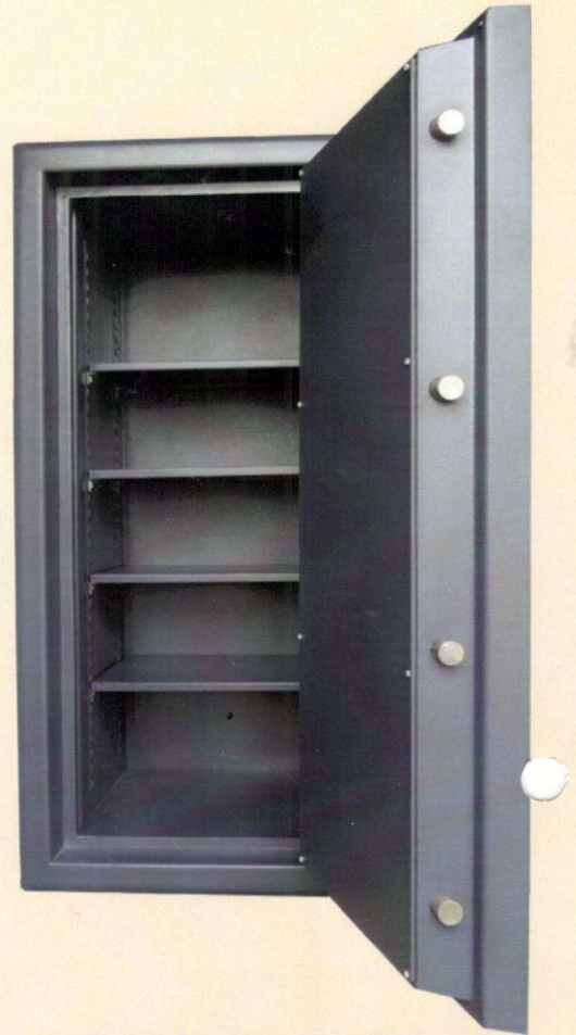
'BB' Class Safe - Open Condition

120-121, 1st Floor, Swastik Disa Corporate Park, Kohinoor Textile Printing Compound, Opp. Shreyas Cinema, L.B.S. Marg, Ghatkopar (W), Mumbai - 400086. Tel. Nos. +91 22 4015 8060, 4004 9400, 2500 1903 Email ID: safeagesec@gmail.com Web : www.safeage.in