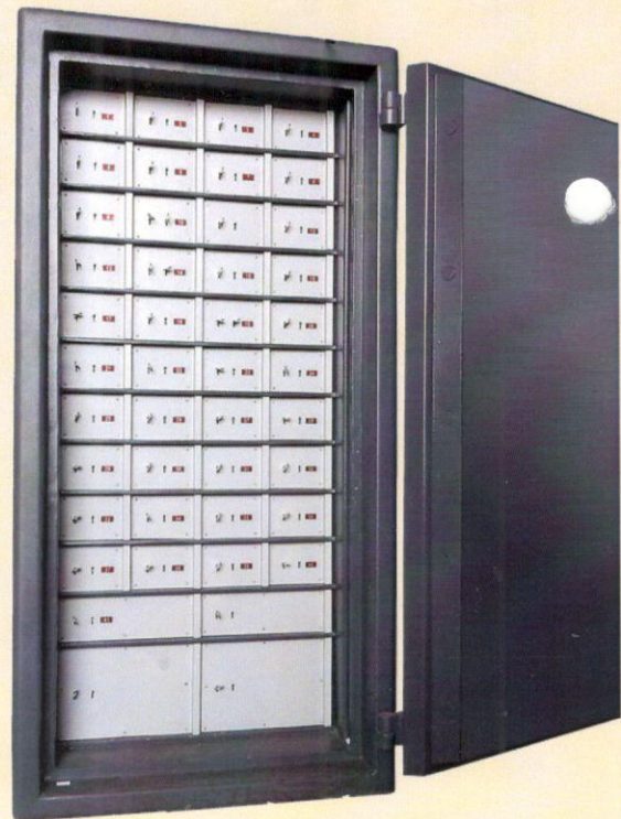
Safe with Safe Deposit Lockers