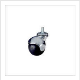
Black Caster Wheel