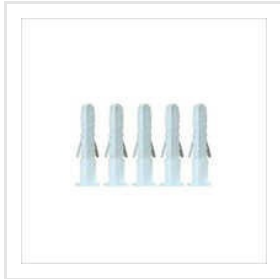
White Plastic Wall Plug