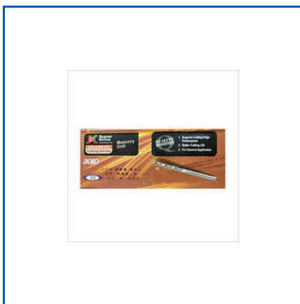
SS MASONRY DRILL

50mm Eight Steel Lever Locks, 5M Freemans IKON Industrial Inch Tape, Abrasive Grinding Wheel, Black Caster Wheel, Ceiko Wire Nails, Cherry Color Curtain Pipe Rod, Coated Bonded Abrasive Roll, Concrete Nails, Curtain Rod Fitting, Door Closer, Door Silencer, Door Spring, Door Stopper Rubber For Main Door, Door Tower Bolts, Extra Heavy Duty Gate Hook, etc.