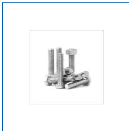
INDUSTRIAL NUTS AND BOLTS