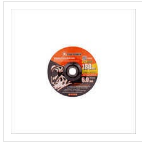
Abrasive Grinding Wheel