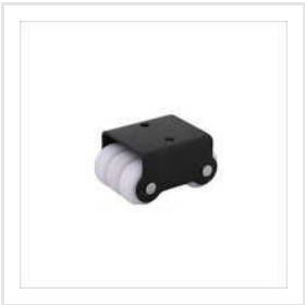
Six Castor Wheel