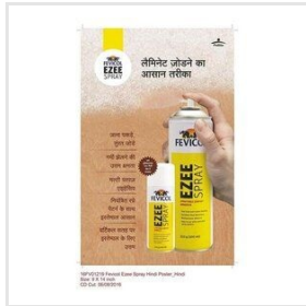
Fevicol Ezee Spray