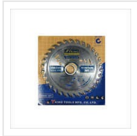
TCT Saw Blades