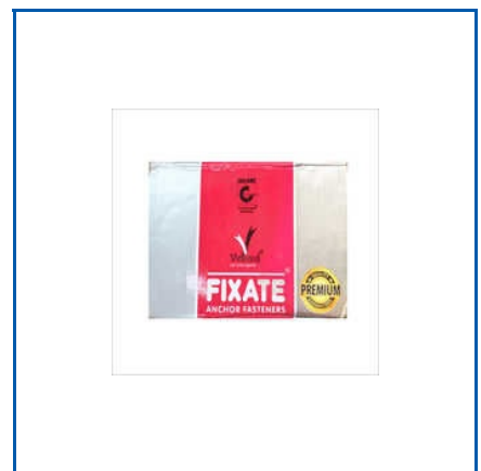
FIXATE ANCHOR FASTENERS