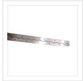
Stainless Steel Piano Hinges