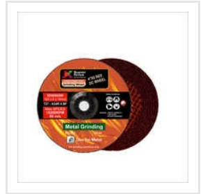
Metal Grinding Wheel