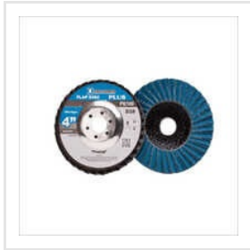
PU 100 4 Inch Flap Disc