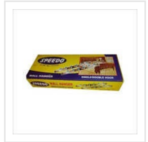
Single And Double Hook Wall Hangers