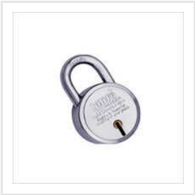
50mm Eight Steel Lever Locks