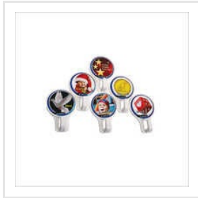
Plastic Wall Hangers Hooks