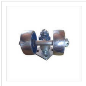
Tope Caster Wheel