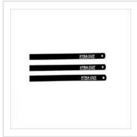
Xtra Cut Hacksaw Blades