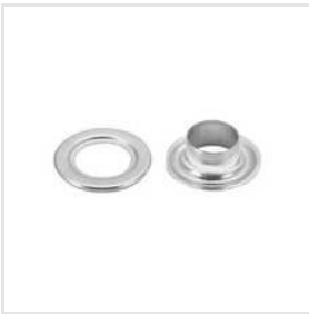
Tarpaulin Aluminum Eyelet