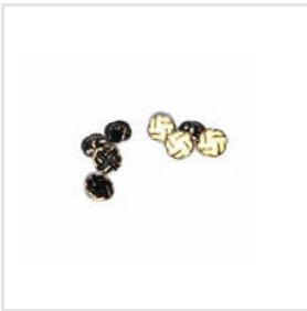
Shirt Kurta Unisex Fancy Buttons