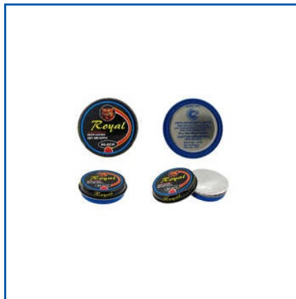
ROYAL SHOES POLISH