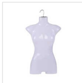
Hanging Display Mannequins