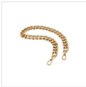
Metal Chain For Handbags