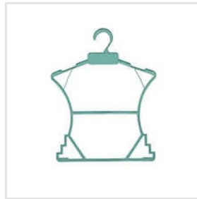
Baby Pvc Frock Hanger