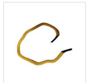
Tipping Paper Rope