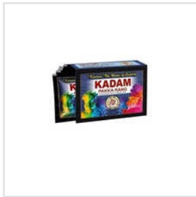
Cloth Dye Colour