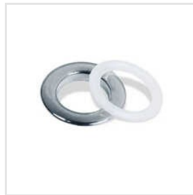
Curtain Eyelet Ring