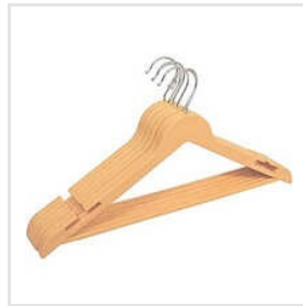
PVC Cloth Hanger