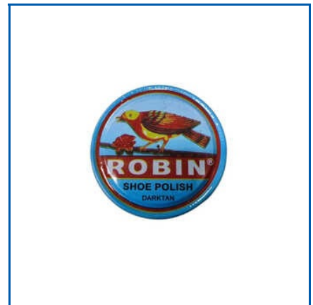
30 GRAM ROBIN SHOE POLISH