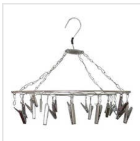
Steel Cloth Clip Hanger