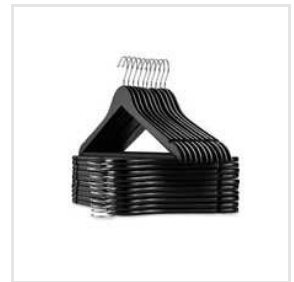
Plastic Cloth Hangers