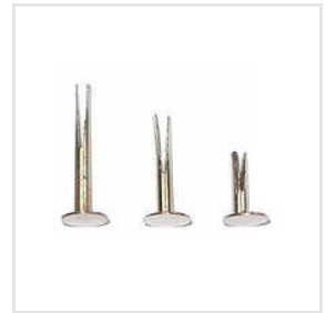
Metal Bifurcated Rivets