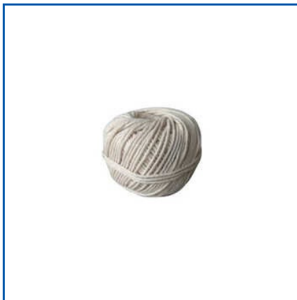
POLYESTER THREAD BALL

18mm Bags Magnetic Buttons, 2.5 Inch Stainless Steel Agarbatti Stand, 20ml Industrial Flex Bond, 2mm PVC Chain, 30 gram Robin Shoe Polish, Acrylic Tray Shoes Display, Alert Sole Shoes, Baby Pvc Frock Hanger, Black Memory Shoes Insole, Black Shoes Laces, Cloth Drying Rope Elastic with clip, Cloth Dye Colour, Colored Zippers, Crystal Diamond Sofa Button, Curtain Eyelet Ring, etc.