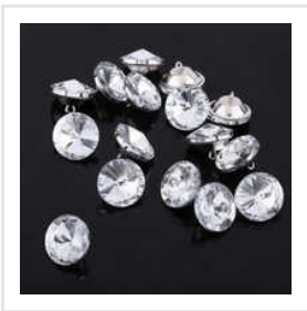
Crystal Diamond Sofa Button