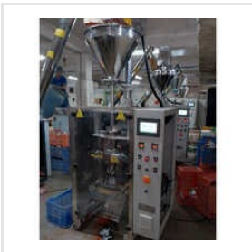
Collar Type Servo Based Auger Filler