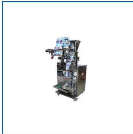
PNEUMATIC CUP FILLER MACHINE