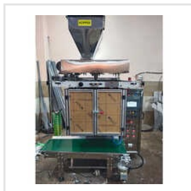
Multi Track Slide Based Powder Filling Machine