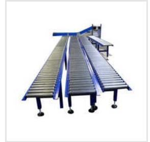
Industrial Roller Conveyor