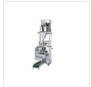
Fully Pneumatic Weigher Based Pouch