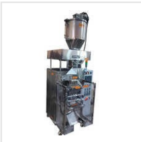
Mini Multi Track Machine