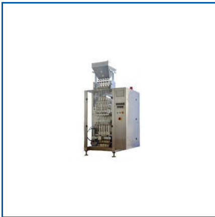
VERTICAL FORM FILL AND SEAL MACHINE

APS-300P Vertical Form Fill Sealing Machine, APS-600 SS Cup Filler Machine, APS-600 SS Multi Track Liquid Packing Machine, APS-800 SS Automatic Multi Track Powder Packing Machine, APS-800 SS Liquid Packing Machine, Auger Filler Packing Machine, Automatic Form Fill And Seal Machine, etc.