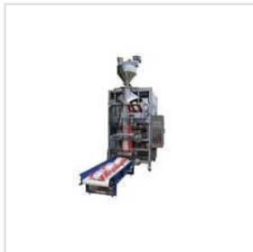
Auger Filler Packing Machine