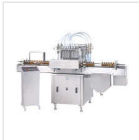
Jar Filling Line