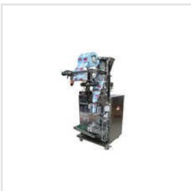
Pneumatic Cup Filler Machine