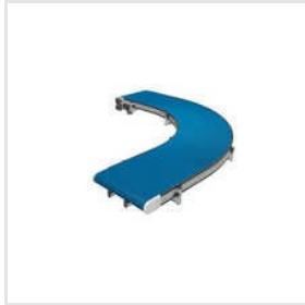
Stainless Steel Flexible Belt Conveyor