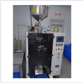
Pickle Filling Machine