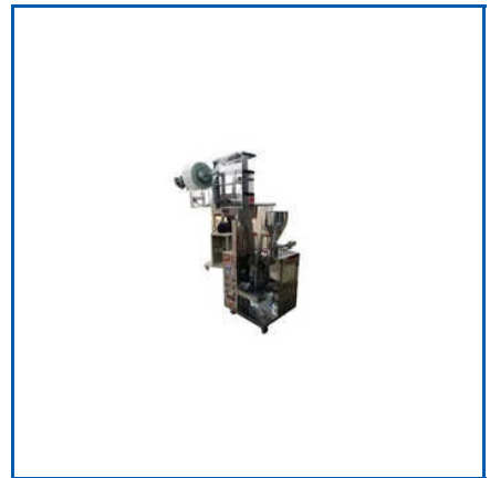
PNEUMATIC LIQUID FILLER PACKING MACHINE