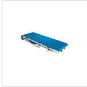
Industrial Belt Conveyor