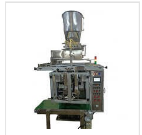
Multi Track Liquid Filling Machine