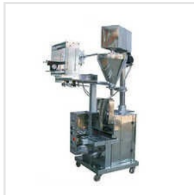
Digital Servo Based Pneumatic Packing