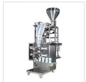
Automatic Vertical Pouch Packing