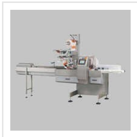
Flow Wrap Machine