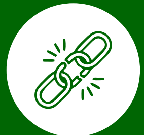
Super Stretch Effect