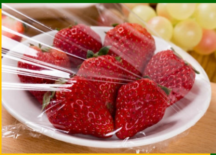
Fruit & Veg Wrapping