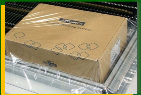
Pharma Box Wrapping