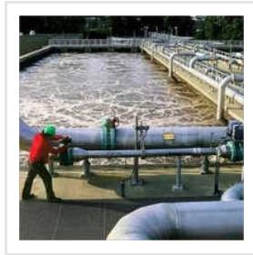
Water Treatment Plant Maintenance Services