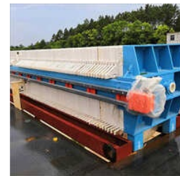
INDUSTRIAL FILTER PRESS MACHINE