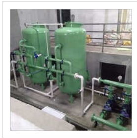
Industrial Water Softening Plant