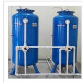
Industrial Sand And Carbon Filter Plant