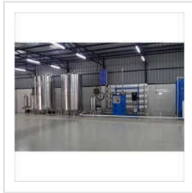
Industrial RO Plant