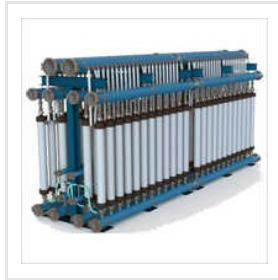
Industrial Ultrafiltration Plant