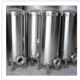
Stainless Steel Micron Filter