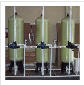
Industrial DM Plant