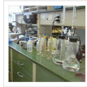
R And D Laboratory Glassware