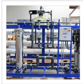
Industrial Nano Filtration Plant