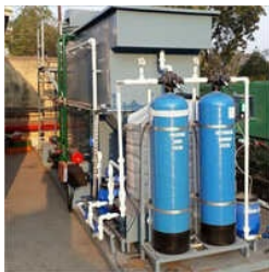
INDUSTRIAL EFFLUENT TREATMENT PLANT

Commercial Water Softener Plant, Commercial Water Treatment Plant, Electrical Water Ozonator, Funnel Type Oil Skimmer, Industrial DM Plant, Industrial Effluent Treatment Plant, Industrial Filter Press Machine, Industrial Iron Removal Plant, Industrial Nano Filtration Plant, Industrial RO Plant, Industrial Sand and Carbon Filter Plant, Industrial Sewage Treatment Plant, Industrial Ultrafiltration Plant, Industrial Water Softening Plant, Industrial Water Treatment Plant, etc.