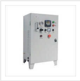
Electrical Water Ozonator