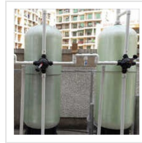
Commercial Water Softener Plant