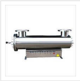
Stainless Steel Ultraviolet System