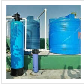
Industrial Iron Removal Plant