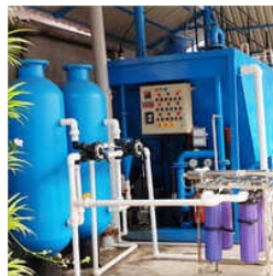
INDUSTRIAL SEWAGE TREATMENT PLANT