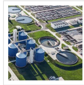
Commercial Water Treatment Plant