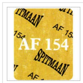
Spitmaan Style AF 154 Asbestos Free Fibre