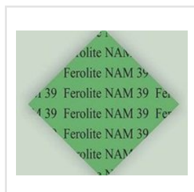
Non Asbestos Gasket Material