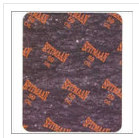
Spitmaan Style 59 Oil Compressed Fibre