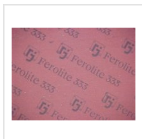
Ferolite 333 Red