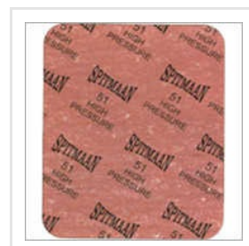
Spitmaan Style 51 High Pressure Compressed