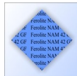
FEROLITE NAM 42 GF