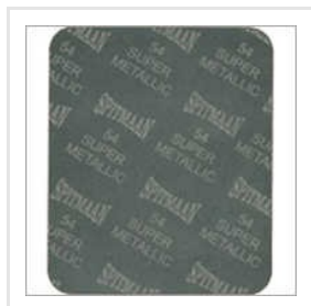
Spitmaan Style 54 Super Metallic