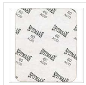
Spitmaan Style 60 Acid Compressed Fibre