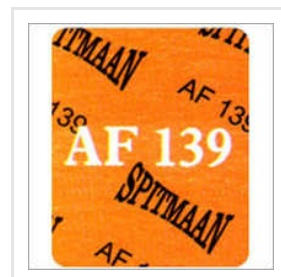
Spitmaan Style AF 139 Asbestos Free Fibre