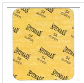
Spitmaan Style 54 Super Compressed