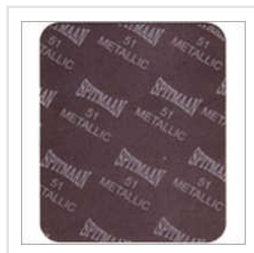
Spitmaan Style 51 Metallic Compressed