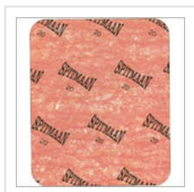
Spitmaan Style 20 Steam Compressed