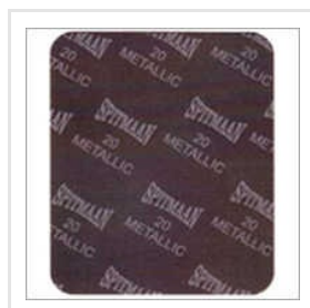
Spitmaan Style 20 Metallic Compressed