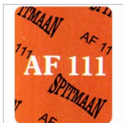
SPITMAAN STYLE AF 111 ASBESTOS FREE FIBRE JOINTING SHEET

Ferolite NAM 39, Ferolite NAM 42 GF, Non Asbestos Gasket Material, Spitmaan Style 20 Metallic Compressed Fibre Jointing Sheet, Spitmaan Style 20 Steam Compressed Fibre Jointing Sheet, Spitmaan Style 39 Compressed Fibre Jointing Sheet, Spitmaan Style 51 High Pressure Compressed Fibre Jointing Sheet, Spitmaan Style 51 Metallic Compressed Fibre Jointing Sheet, Spitmaan Style 54 Super Compressed Fibre Jointing Sheet, Spitmaan Style 54 Super Metallic Compressed Fibre Jointing Sheet, Spitmaan Style 59 Oil Compressed Fibre Jointing Sheet, etc.