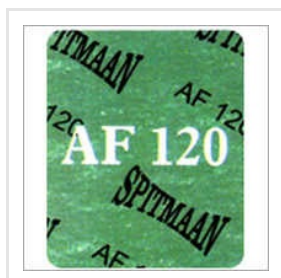
Spitmaan Style AF 120 Asbestos Free Fibre