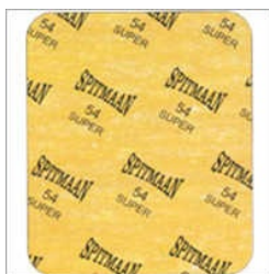
SPITMAAN STYLE 39 COMPRESSED FIBRE JOINTING SHEET