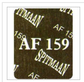
Spitmaan Style AF 159 Asbestos Free Fibre