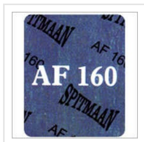
Spitmaan Style AF 160 Asbestos Free Fibre