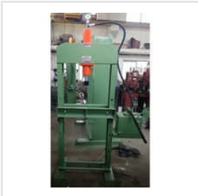
Manual Hydraulic Press Machine