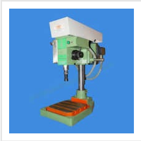
Automatic Pitch Control Tapping