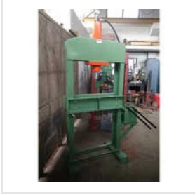
Hydraulic Baling Press