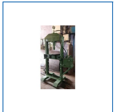
HAND OPERATED H FRAME HYDRAULIC PRESS