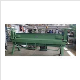
Manual Sheet Metal Bending Machine