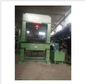
100 Ton Hydraulic Press Machine