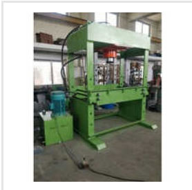
200 Ton Hydraulic Press