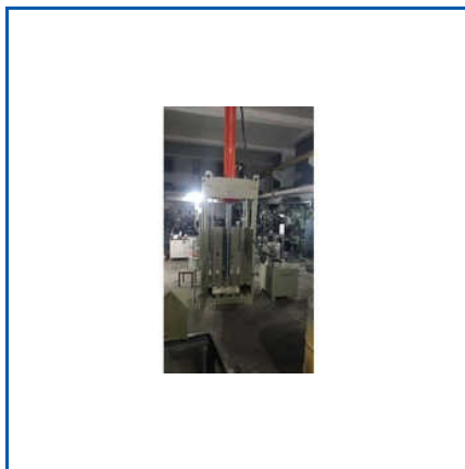
VERTICAL SCRAP BALING PRESSES