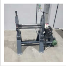
Industrial Sheet Rolling Machine