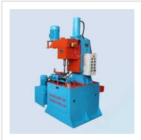
Industrial Hydraulic Drilling Machine