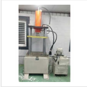
Water Bulging Hydraulic Press