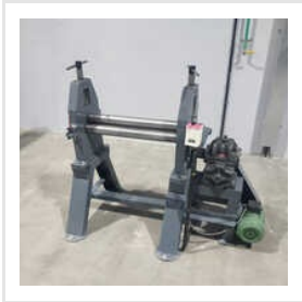
Motorized Sheet Rolling Machine