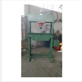
Hydraulic Shop Press