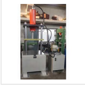
4 Pillar Hydraulic Press Machine