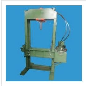
Mild Steel Hydraulic Press Machine