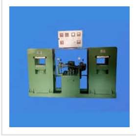
Industrial Rubber Moulding Machine