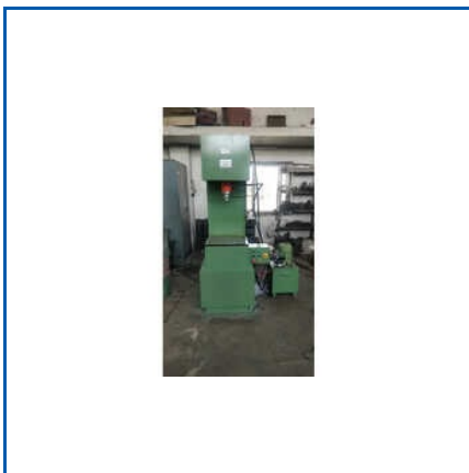
HYDRAULIC C TYPE PRESS MACHINE

100 Ton Hydraulic Press Machine, 200 Ton Hydraulic Press, 4 Pillar Hydraulic Press Machine, Automatic Keyway Milling Machine, Automatic Pitch Control Tapping Machine, Double Acting Hydraulic Cylinder, Hand Operated H Frame Hydraulic Press, Hydraulic Baling Press, Hydraulic C Type Press Machine, Hydraulic Pet Bottle Baling Press, Hydraulic Shearing Machine, Hydraulic Sheet Bending Machine, Hydraulic Shop Press, Industrial Hydraulic Drilling Machine, Industrial Hydraulic Power Pack, etc.