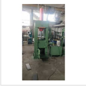
Hydraulic Pet Bottle Baling Press