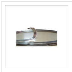
Fey Laminar Rings