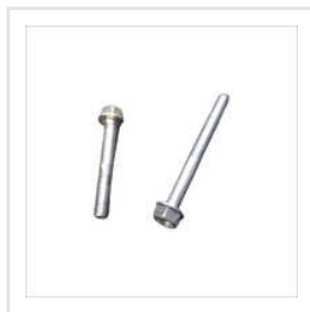
Nut And Bolt