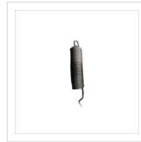
Tension Hook Spring