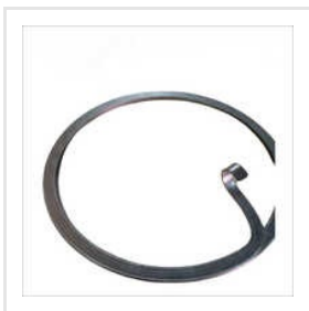
Double Coil Laminar Ring