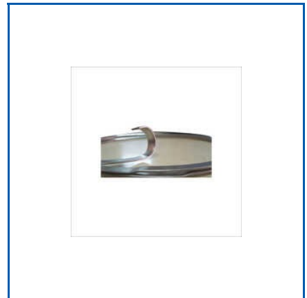
Fey LAMINAR RINGS