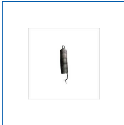
TENSION HOOK SPRING