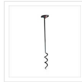
Drain Cleaning Spring