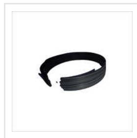
Round Grooved Ring