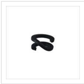
Double Coil Spring Washer