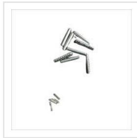
Teeth Spring Dowel Pin