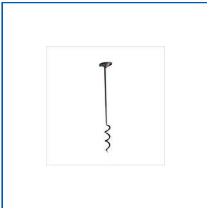
DRAIN CLEANING SPRING

Ap Keys, Double Coil Laminar Ring, Double Coil Spring Washer, Drain Cleaning Spring, External Circlips, Fey Laminar Rings, Grooved Dowel Pin, Internal Circlips, Notch Pin, Nut and Bolt, Round Grooved Ring, Snap Ring, Spring Compression, Taper Grooved Pin, Teeth Spring Dowel Pin, etc.