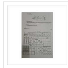
Taper Grooved Pin