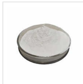
25 Kg Textile Grade Sodium