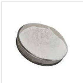
DVP Grade Sodium Carboxymethyl