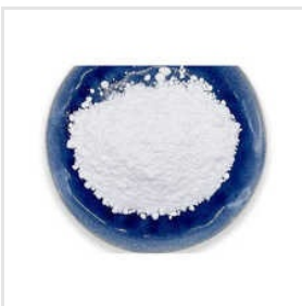
50 Kg Technical Grade Sodium