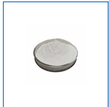
TEXTILE GRADE SODIUM CARBOXYMETHYL CELLULOSE POWDER