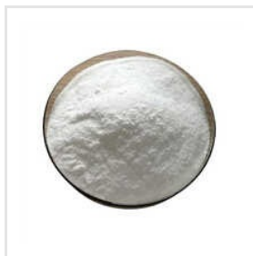
Detergent Grade Sodium