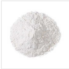
HVB Sodium Carboxymethyl