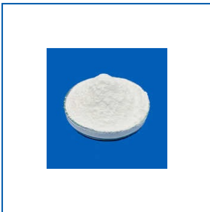
LVB SODIUM CARBOXYMETHYL CELLULOSE POWDER

25 Kg Ceramic Grade Sodium Carboxymethyl Cellulose Powder, 25 Kg Chemical Grade Sodium Carboxymethyl Cellulose Powder, 25 Kg Detergent Grade Sodium Carboxymethyl Cellulose Powder, 25 Kg Paint Grade Sodium Carboxymethyl Cellulose Powder, 25 Kg Redispersible Powder, etc.