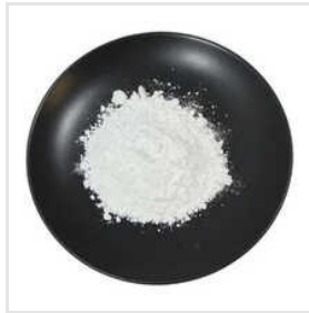
25 Kg Chemical Grade Sodium