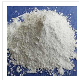
MVB Sodium Carboxymethyl