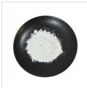
25 Kg Ceramic Grade Sodium