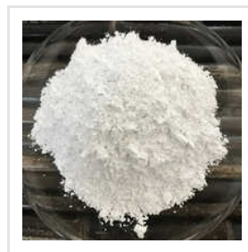
25 Kg Technical Grade Sodium