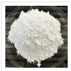
Oil Drilling Sodium Carboxymethyl