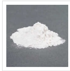
25 Kg Detergent Grade Sodium