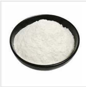
50 Kg Chemical Grade Sodium