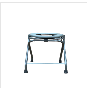
Folding Commode Stool