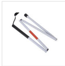
Blinds Walking Stick