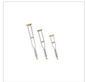
Under Arm Crutches