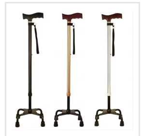
Quadripod Walking Stick