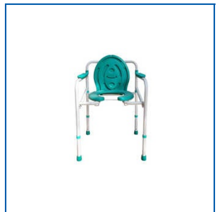
HEIGHT ADJUSTABLE COMMODE CHAIR