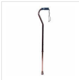
DHC-938 Aluminium Walking Stick