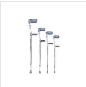
Aluminium Rebuilt Forearm Crutch