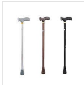
Adjustable Walking Stick