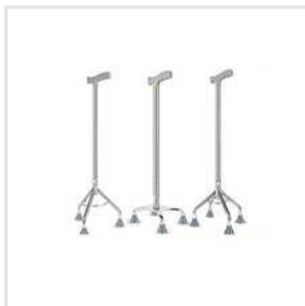
Aluminium Chrome Quad Stick