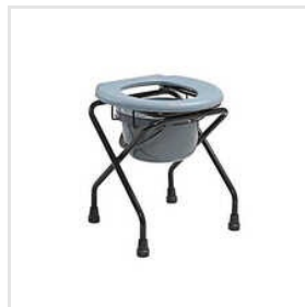
Grey Fiber Commode Stool