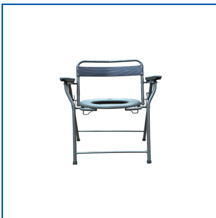
FOLDING COMMODE CHAIR

809 Chrome Wheel Chair, Adjustable Walking Stick, Aluminium Chrome Quad Stick, Aluminium Rebuilt Forearm Crutch, Aluminum Shower Stool, Blinds Walking Stick, Blue Patient Backrest, Commode Chair, Commode Stool, DHC-919 Aluminium Folding Walker, DHC-938 Aluminium Walking Stick, Elderly Folding Adjustable Walker, Folding Commode Chair, Folding Commode Stool, Folding Walker, etc.