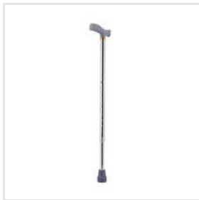
Silver Walking Stick