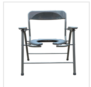
Folding Commode Chair