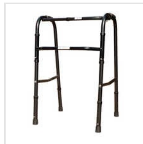
Elderly Folding Adjustable Walker