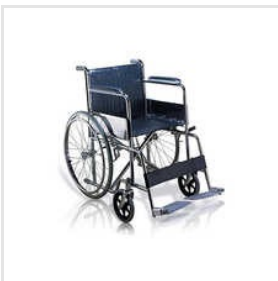
809 Chrome Wheel Chair