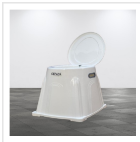
Plastic Commode Stool