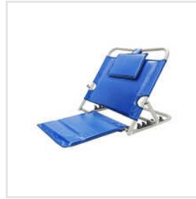
Blue Patient Backrest