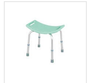
Light Weight Shower Stool