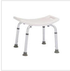
Aluminum Shower Stool