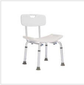
Standard Shower Chair