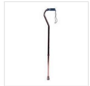
DHC-938 Aluminium Walking Stick