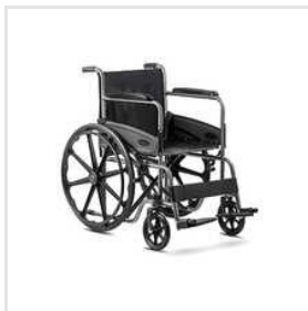
Heavy Duty Wheel Chair