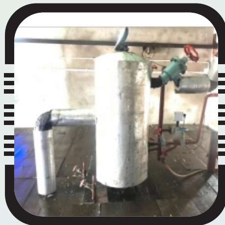
Accumulator - Surge Drum