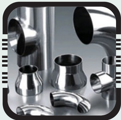
Seamless Pipeline Fittings