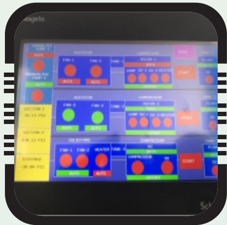
Ice Plant Automation