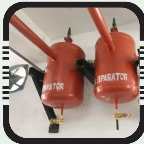
Ammonia Oil Separator