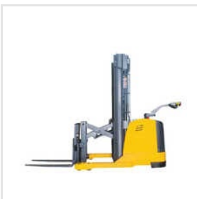
Electric Reach Stackers