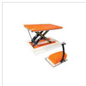
Low Profile Scissor Lift Platform