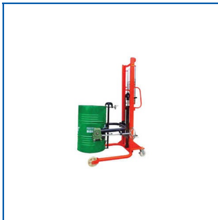
DRUM-BARREL STACKER CUM LIFTER

Articulated Boom Lift, Battery Operated Shop Floor Crane, Double Mast Aerial Work Platform, Drum Barrel Shifter, Drum Grab Attachment, Drum Stacker Cum Tilter, Drum-Barrel Grabs, Drum-Barrel Stacker Cum Lifter, EOT Crane, Economic Battery Operated Pallet Truck, Electric Fork Reach Trucks, Electric Forklift Trucks, Electric Pallet Truck, Electric Reach Stacker, Electric Reach Stackers, etc.