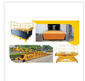
Loading Unloading Platforms Or Docks