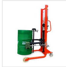
Drum Stacker Cum Tilter