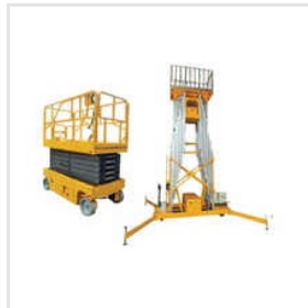
High Lift Maintenance Platform