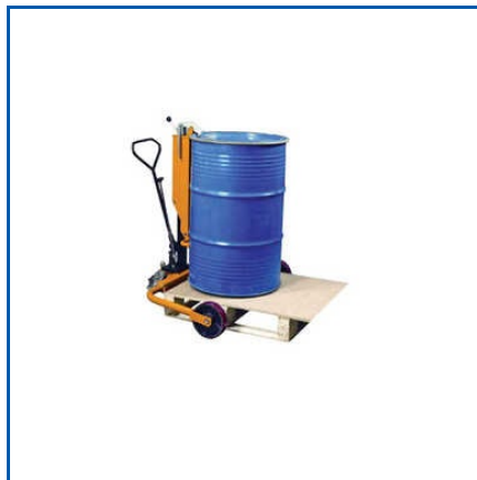
DRUM BARREL SHIFTER