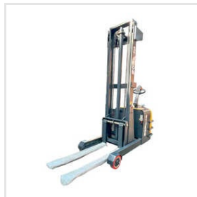
Electric Reach Stacker