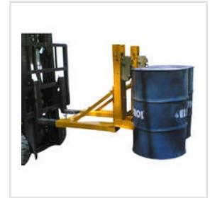
Drum Grab Attachment