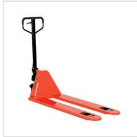
Low-Profile Pallet Truck