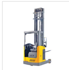
Reach Lift Trucks