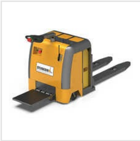
Electric Pallet Truck