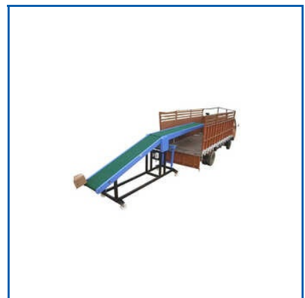
TRUCK LOADING CONVEYORS