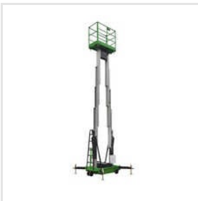
Aerial Work Platform