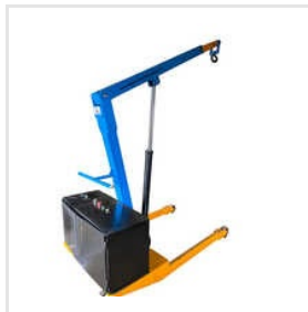
Semi Electric Floor Crane