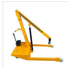
Manual Floor Crane