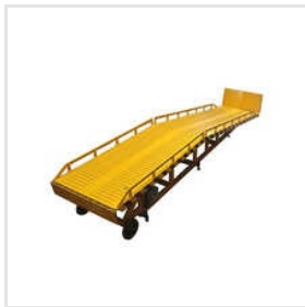
Industrial Dock Ramp