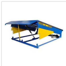
Industrial Dock Leveller