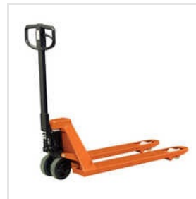
Manual Hand Pallet Trucks