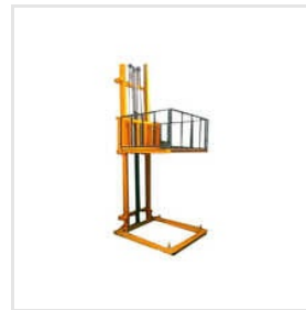
Single Mast Hydraulic Goods Lift