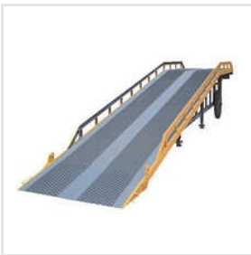
Hydraulic Loading Dock Ramp