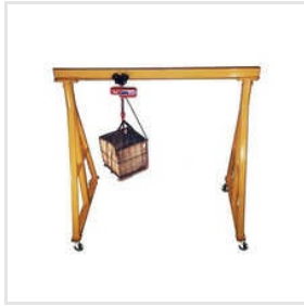
Jib Gantry Crane