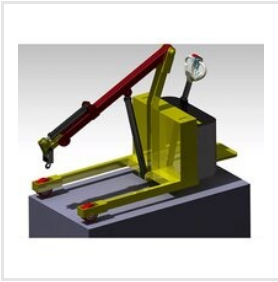
Fully Electric Floor Crane