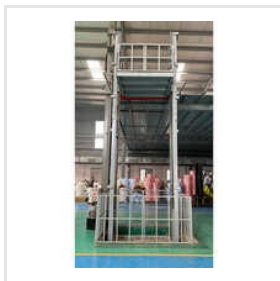
Double Mast Goods Lift