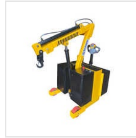
Industrial Floor Crane