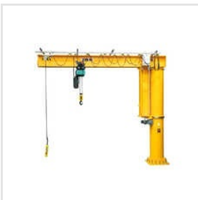
Industrial Jib Crane