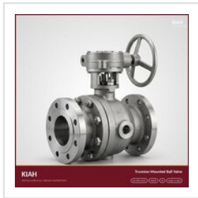
Trunnion Mounted Ball Valves