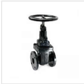
1.5 Inch Cast Iron Sluice Valve