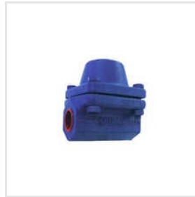
15 Mm Spirax BPT 21 AV 21 Air Vent Valve