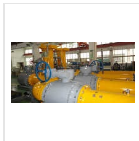
Bellow Sealed Valve