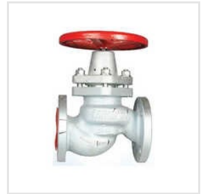
1.5 Inch Forbes Marshall Flanged End