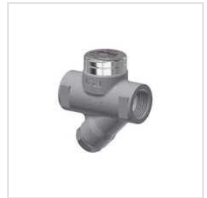
Steam Trap Valve