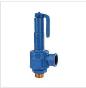
1-4 Inch Mild Steel Safety Relief Valve