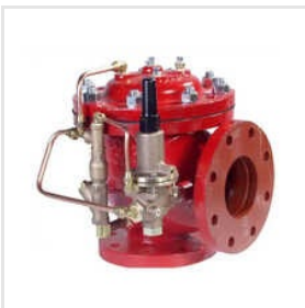
Pressure Relief Valve