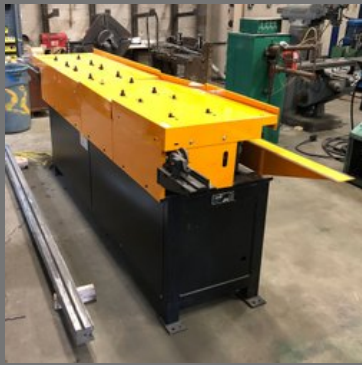
Tdf Duct Flange Forming Machine