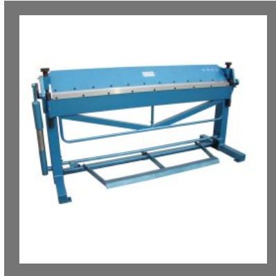
Gi Sheet Metal Bending Machine