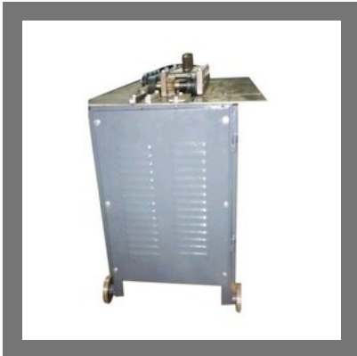
Automatic Lock Forming Machine