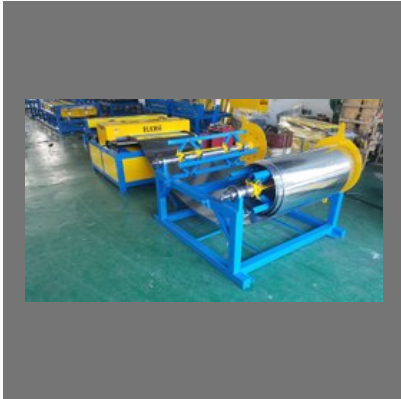
Auto Duct Forming Machine