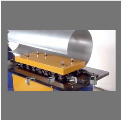
GI ROUND DUCTING MACHINE