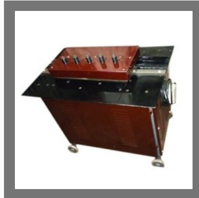
G.i sheet Lock Forming Machine