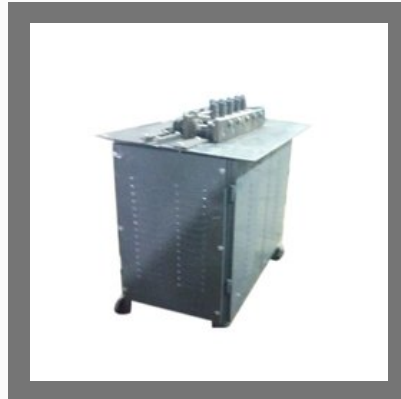
Light Gauge Lock Forming Machine