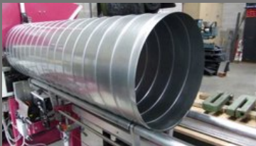
Aluminium Duct Forming Machine