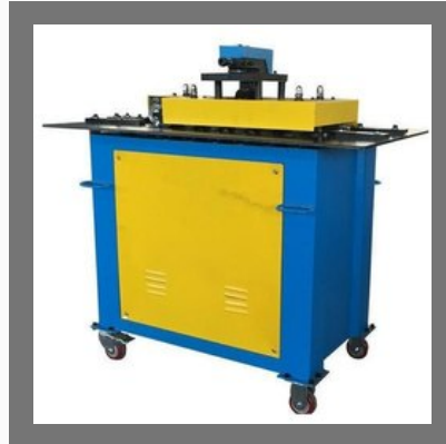
GI Sheet Building Duct Machine