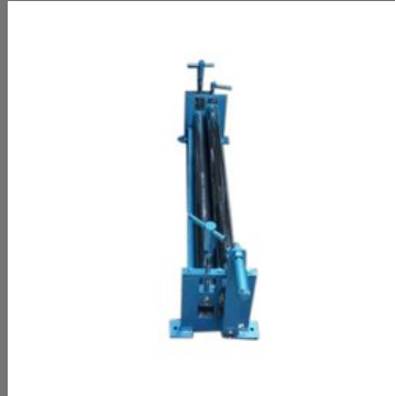
Manual Stainless Steel Binding Machine