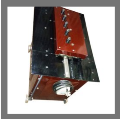
Semi Automatic Lock Forming Machine