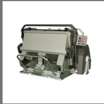
Victoria Die Cutting Machine