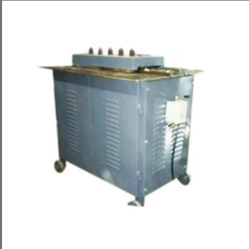
Duct Lock Forming Machine