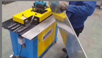
WNS Auto Duct Forming Machine