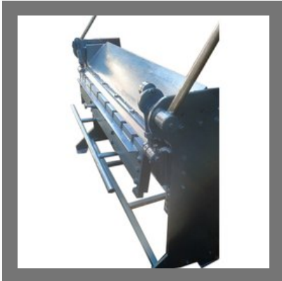
Manual Sheet Bending Machine