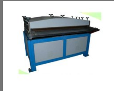
Duct Grooving Machine