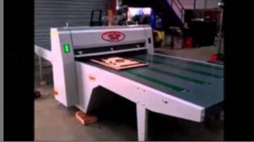
Flatbed Roller Die Cutter