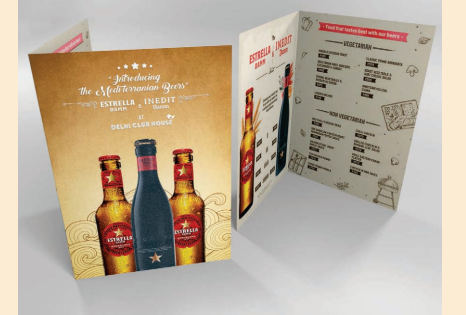
TABLE & TAKE-AWAY MENU CARDS