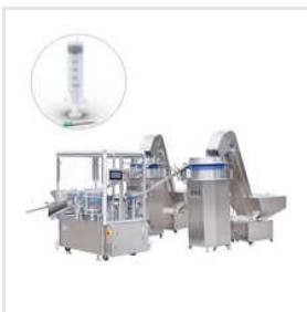
Syringe Assembly Machine