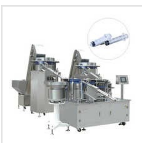
Syringe Production Machine