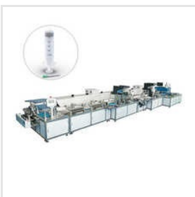
Needle Assembly Machine