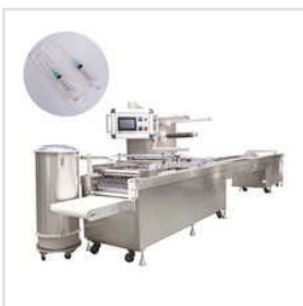
Soft Blister Packing Machine