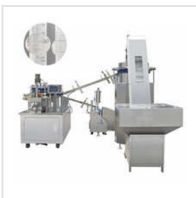
Syringe Printing Machine