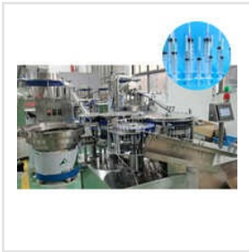
Syringe Assembly Machine