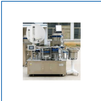
DISPOSABLE SYRINGE MAKING MACHINE