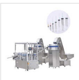
Syringe Making Plant