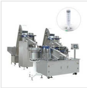
Fully Automatic Syringe Assembly