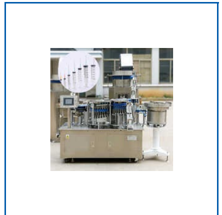
DISPOSABLE SYRINGE MANUFACTURING MACHINE