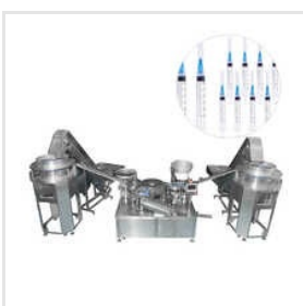
Syringe Production Plant