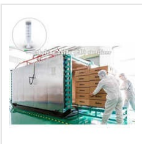
Ethylene Oxide Sterilizer