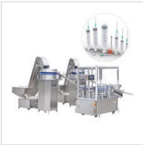
Disposable Syringe Manufacturing Plant