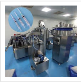
Disposable Syringe Production Machine