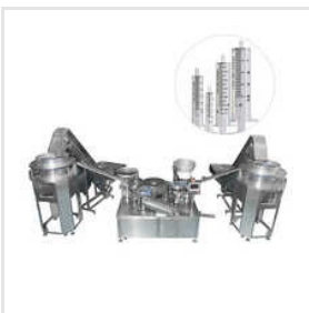
Syringe Making Machine