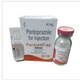
Pantoprazole For Injection