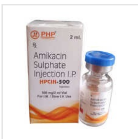
Amikacin Sulphate Injection IP