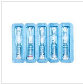
75mg Diclofenac Injection