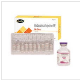
Ondansetron Injection IP