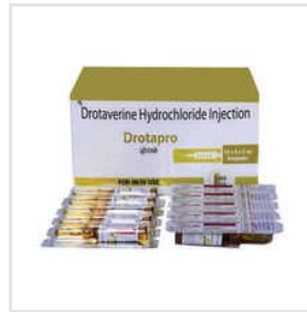
Drotaverine Hydrochloride Injection