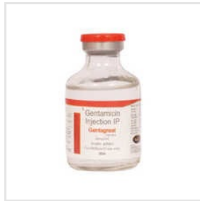
80mg Gentamicin Injection