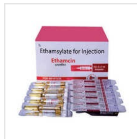
Ethamsylate For Injection