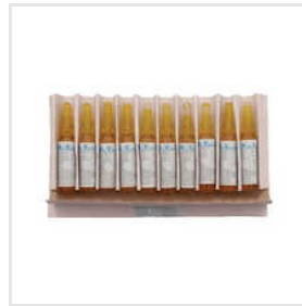
Multivitamin Infusion Injection