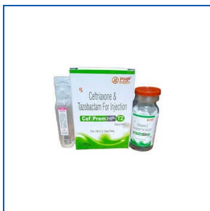
CEFTRIAXONE AND TAZOBACTAM FOR INJECTION

1.5gm Cefoperazone And Sulbactam For Injection, 100mg Itraconazole Capsules, 200mg Fluconazole Tablets IP, 200mg Itraconazole Capsules, 20mg Omeprazole Gastro Resistant Capsules IP, 20mg Pharmaceutical Omeprazole Gastro-Resistant Capsules, 20mg Rabeprazole Sodium Gastro Resistant Tablets IP, etc.