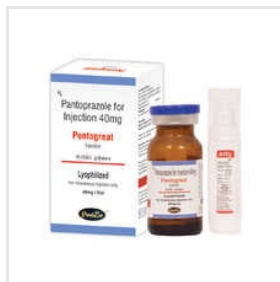
40mg Pantoprazole Injection