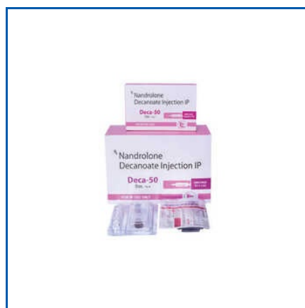
DECANOATE INJECTION IP