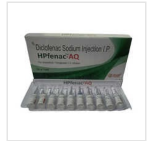
Diclofenac Sodium Injection IP