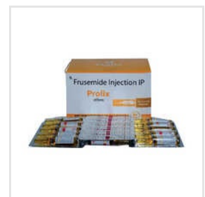
Frusemide Injection IP