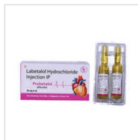
Labetalol Hydrochloride Injection