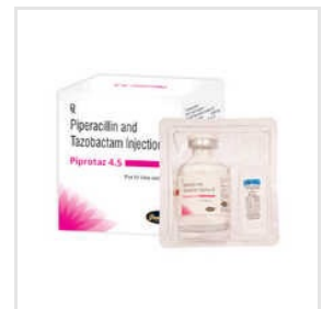
Piperacillin And Tazobactam Injection