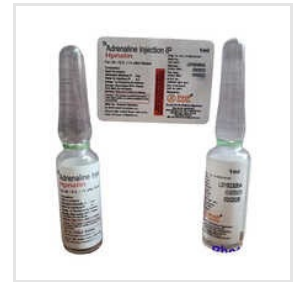
Adrenaline Injection IP