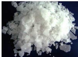
Caustic Soda Flakes