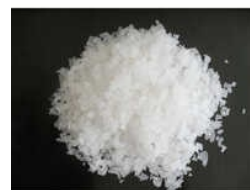
Sodium Nitrate Crystal