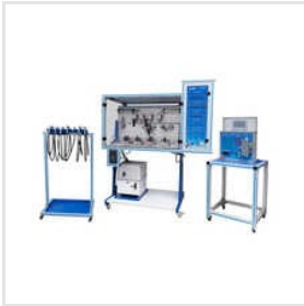
Industrial Hydraulic Trainer Kit