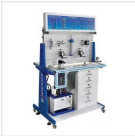
PLC Based Hydraulic Trainer Kit