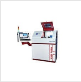
CNC Lathe Trainer Machine With Slant