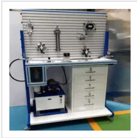
Basic Hydraulic Trainer Kit For Education