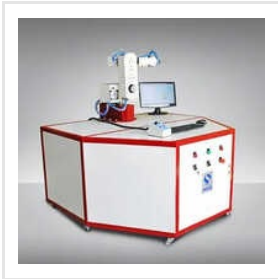
6 Axis Educational Robot Trainer Machine