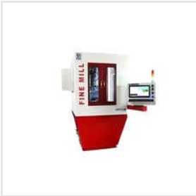
CNC Drill CNC Trainer Mill Machine