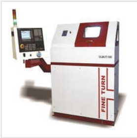
Sinewave Educational CNC Lathe Machine For