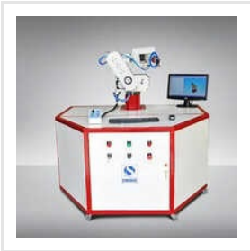
Vertically Articulated 6 Axis Educational Robot