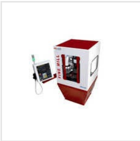
Educational CNC Trainer Mill Machine