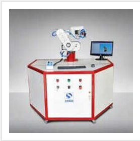
6 Axis Educational Robot Trainer Machine