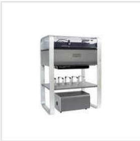
Desktop Mini CNC Waterjet Cutting