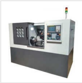
CNC Lathe Trainer Machine For Education