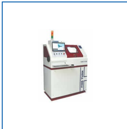
AUTOMATIC CNC LATHE TRAINER MACHINE FOR ENGINEERING COLLEGES