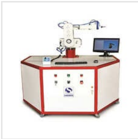
PC Based 6 Axis Educational Robot