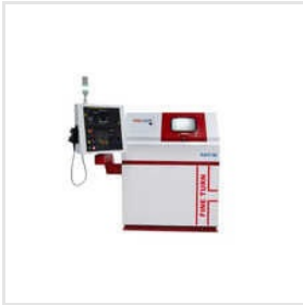
CNC Lathe Trainer Machine With Fanuc