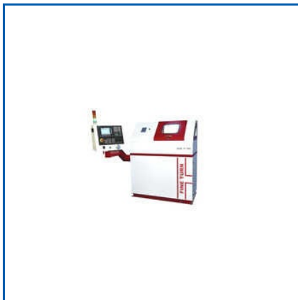
FANUC CNC LATHE TRAINER MACHINE

01_SCR-01 Educational Robot, 01_University Educational Robot, 02_SCR-01 Educational Robot, 02_University Educational Robot, 03_University Educational Robot, 6 Axis Educational Robot Trainer Machine, 6 Axis Educational Robot Trainer Machine For Engineering, 6 Axis Tutor Educational Robot Trainer Machine, Advanced Modular Manufacturing Set, Automatic CNC Lathe Trainer Machine for Engineering colleges, etc.