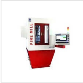
VMM-200 CNC Trainer Mill Machine