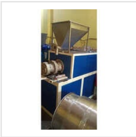
Automatic Rectangle Mad Angle Extruder