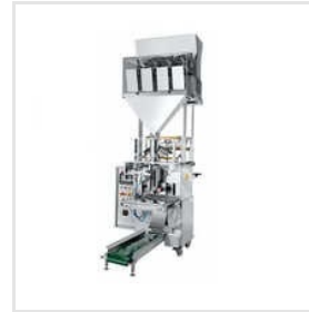
Automatic Chips Packaging Machine