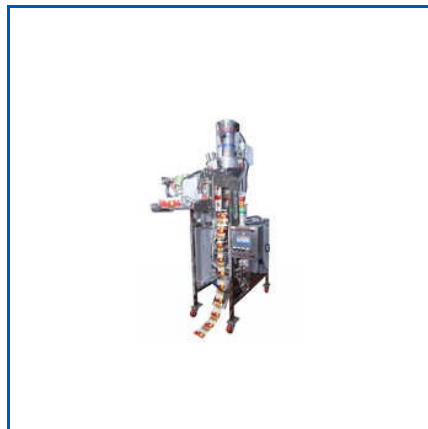
SPICES POUCH PACKAGING MACHINE