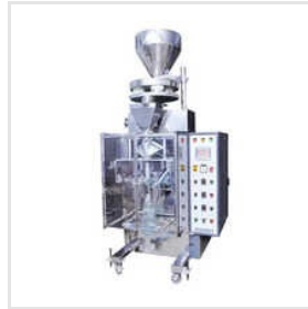
Collar Type Pouch Packaging Machine