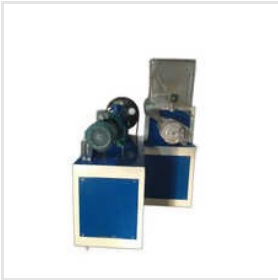
Automatic Kurkure Pouch Packaging Machine