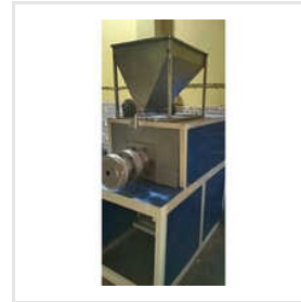
Puff Snacks Extruder