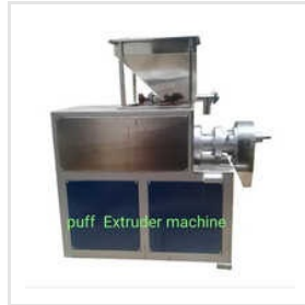
Kurkure Puff Extruder