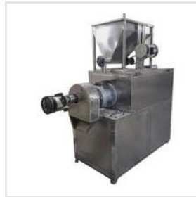
Automatic Puffed Rice Making Machine