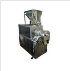
Cheese Ball Extruder