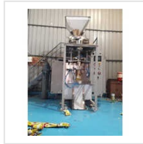
Gutka Pouch Packaging Machine