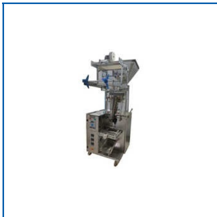
SEMI AUTOMATIC POUCH PACKAGING MACHINE

1 HP Pouch Packaging Machine, 240 V Puff Roaster Machine, Automatic Chips Packaging Machine, Automatic Kurkure Making Machine, Automatic Kurkure Pouch Packaging Machine, Automatic Masala Mixer Machine, Automatic Masala Mixture Handa Machine, Automatic Packaging Machine, Automatic Pouch Packaging Machine, Automatic Puff Roasting Machine, etc.