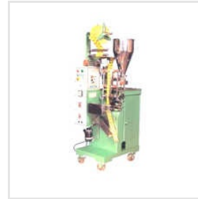
Pneumatic Pouch Packaging Machine