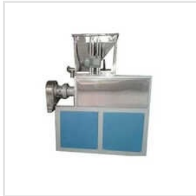
Corn Ring Snacks Food Extruder