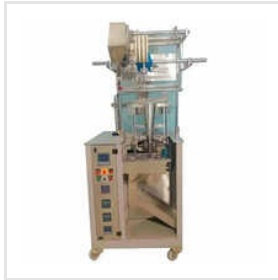
Pneumatic Pouch Packaging Machine