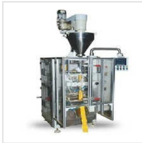
Snack Food Extruder