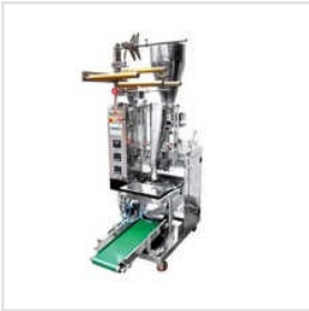
Collar Type Pouch Packaging Machine