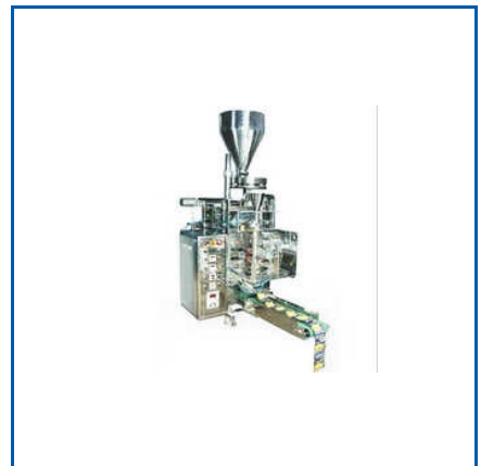
1 HP POUCH PACKAGING MACHINE