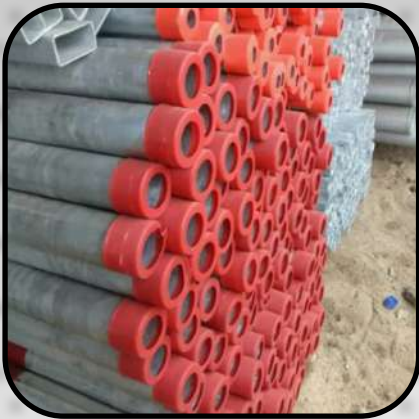
GI Round Pipe