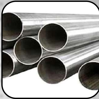
MS Round Pipe