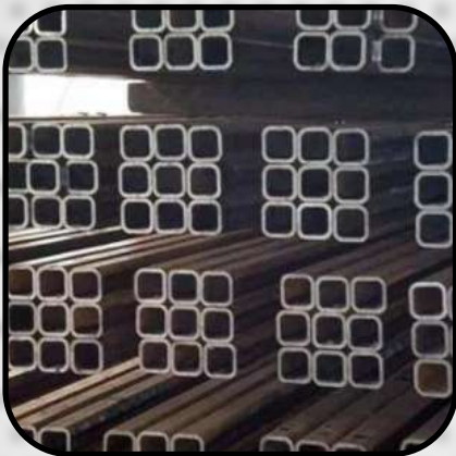
MS Square Tubes