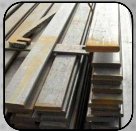
MS Flat Bar