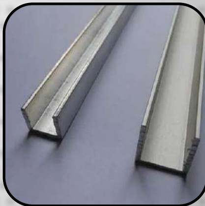
U Beam Channel