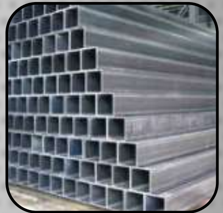
MS Square Pipes