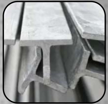
MS T Angle