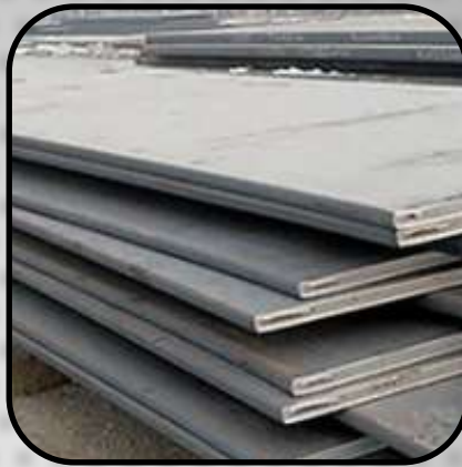
Hot Rolled Plate