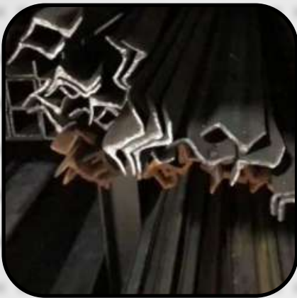
MS Z Angle