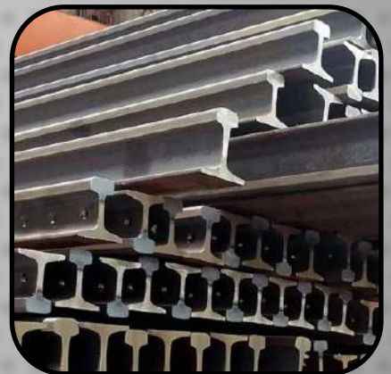
MS I Beam