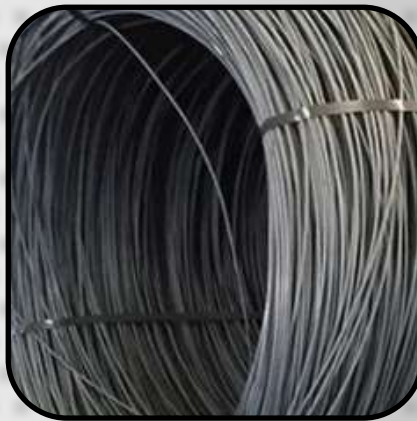
MS Wire Rods