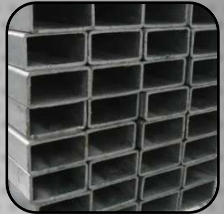
MS Rectangular Pipes