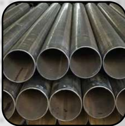
MS Spiral Weld Pipes