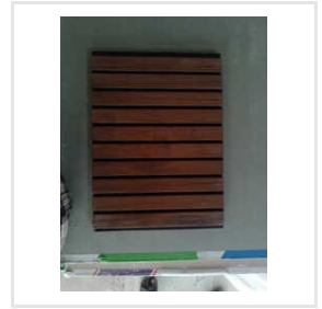
Pvc Wall Panel