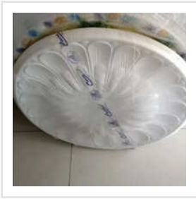
White Round Ceiling Rose