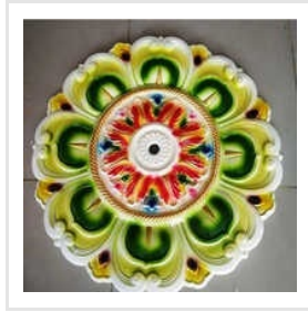
Gypsum Round Ceiling Rose