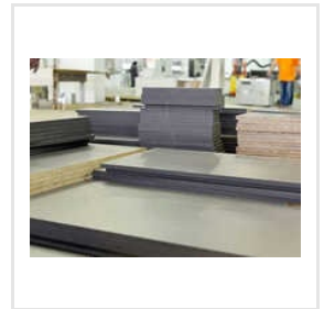
Bison Cement Particle Board