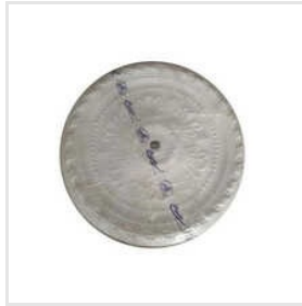
Round False Ceiling Rose