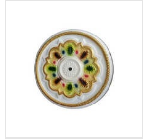
Designer Round Ceiling Rose