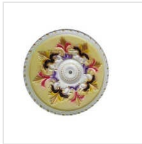
Color Coated Round Ceiling Rose