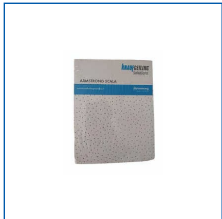
ARMSTRONG CEILING TILE