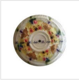
Flower Design Round Ceiling Rose