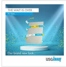
Usg Boral Standard Gypsum Board