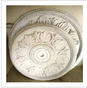
Decorative Round Ceiling Rose