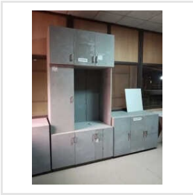
Prelaminated Bison Board