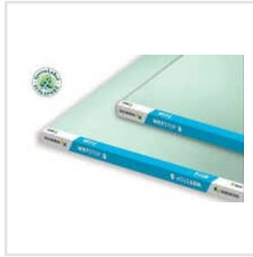
Lagyp Gypsum Board