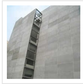
Bison Panel Cement Bonded Particle Board