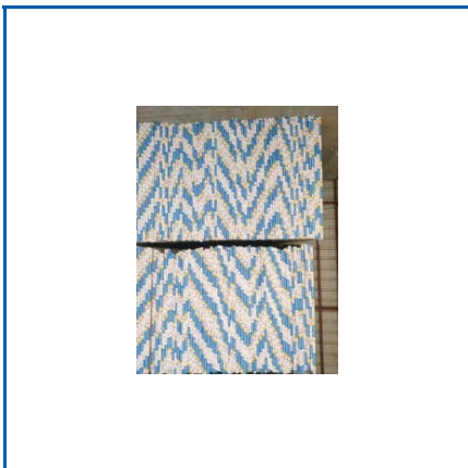
GYP BOARD SAINT GOBAIN CEILING BOARDS

Aac Concrete Blocks, Acoustic Panels, Aerocon Wall Partition Panel, Armstrong Ceiling Tile, Bison Board, Bison Cement Particle Board, Bison Panel Cement Bonded Particle Board, Black Silhouette Grids ( Black Rev. Grid), Bond It By Saint Gobain Gyproc Bonding Agent, Calcium Silicate Acoustic Tile, Color Coated Round Ceiling Rose, Decorative Plaster Corbel, Decorative Round Ceiling Rose, Designer Cement Sheet Lake And Hill, Designer Round Ceiling Rose, etc.