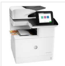
Digital Photocopier Machine