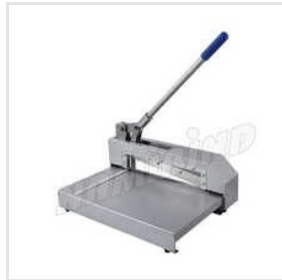
322 Heavy Duty Metal Cutter