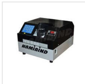
NB 888 Bundle Note Counting Machine