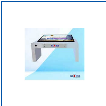
GIL DTT 65 DIGITAL TOUCH TABLE