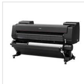
Canon Wide Format Printer