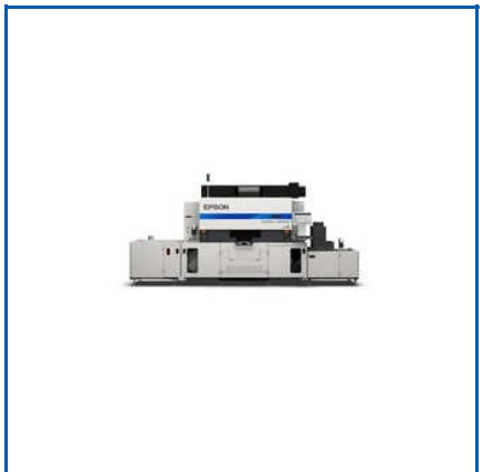
EPSON SUREPRESS L-6534VW DIGITAL LABEL PRESS