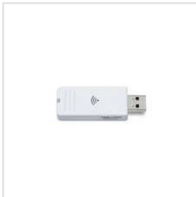
ELPAP11 Wireless LAN Adapter