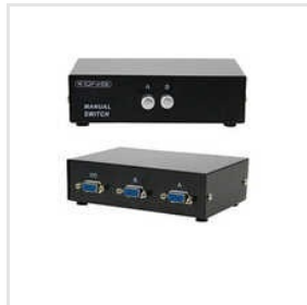
Skynet VGA Switcher