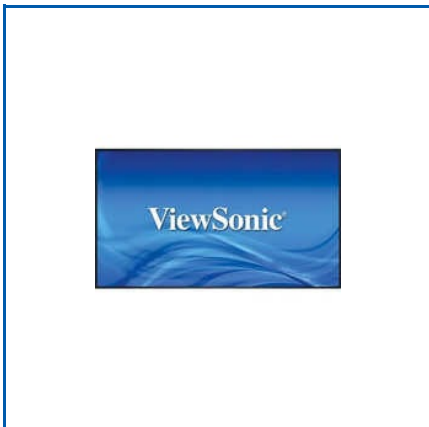
CDP9800 VIEW BOARD

2201 Label Printer, 250 I Bizhubc Office Multifunction Printer, 266 I Bizhubc Office Multifunction Printer, 277 I Bizhubc Office Multifunction Printer, 3 RCA Cable, 322 Heavy Duty Metal Cutter, 6136-6136P-6120 Accurio Press, 6600E HD Electric Creasing Machine, A225 Heavy Duty Spiral Binding Machine, A2326 Paper Shredder, Aerem 2601 Air Purifier, Aerem 3001 Air Purifier, Automatic School Timer, BS11 Bar Code Scanner, Bizhub-958-758 Electric Paper Printer, etc.