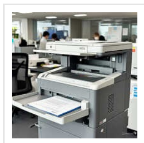
Xerox Photocopier Machine