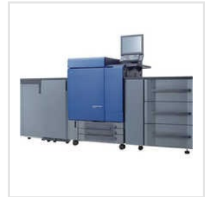
Sheet Printing Press