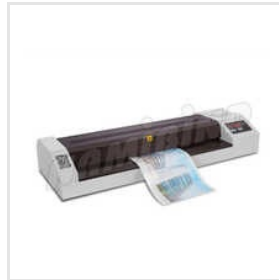
Document Pouch Laminator