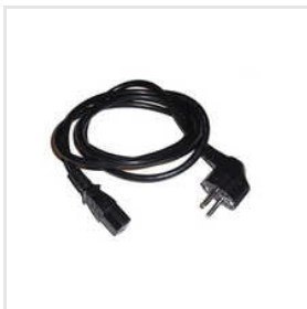
Computer Power Cable