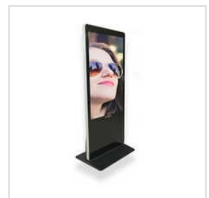
GIL 55VSDW Vertical Signage Display