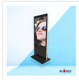
GIL 55VS Vertical Signage Display