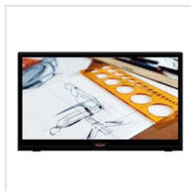
GP-22EMS Interactive Panel