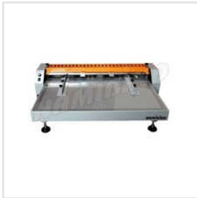
6600E HD Electric Creasing Machine