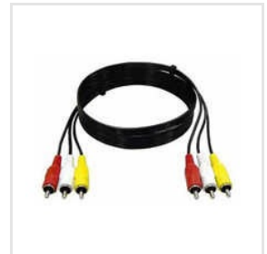
3 RCA Cable