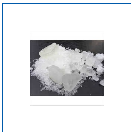
WHITE CAMPHOR CRYSTAL

Mentha Oil, Menthol Crystal, Menthol Liquid, White Camphor Crystal, etc.