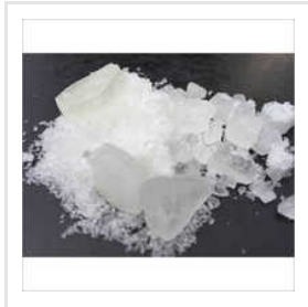
White Camphor Crystal