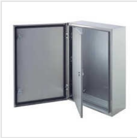
Sheet Metal Enclosure