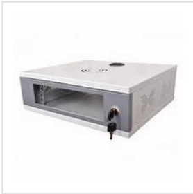
Dvr Rack 2u