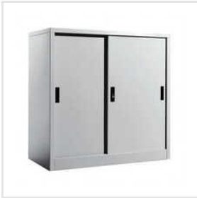
Sheet Metal Cabinets