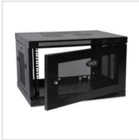
6U Wall Mount Rack