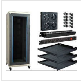
Networking Server Rack