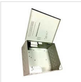
Tele Communication Metal Enclosure