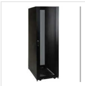
Networking Rack Enclosure