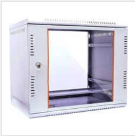
9U Wall Mount Rack