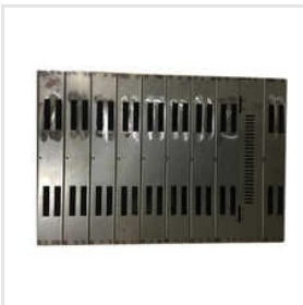
Telecom Cabinet Enclosure