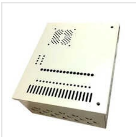
Telecom Outdoor Enclosure