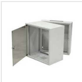
Wall Mounting Steel Enclosures