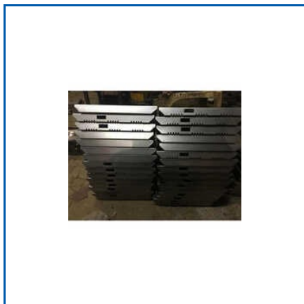
SS SHEET METAL FABRICATION