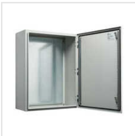
Panel Box Enclosure