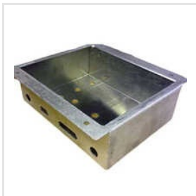
Sheet Metal Enclosure