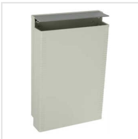
Electrical Telecom Enclosure