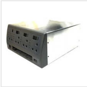
Aluminum Electrical Enclosures