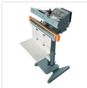
Foot Pedal Operated Series Sealing Machine