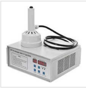
Portable Induction Sealer Machine