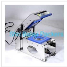
Paper Cup Sealing Machine