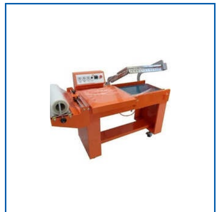
L SEALING MACHINE