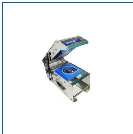
MANUAL PACKING TRAY SEALING CONTAINER MACHINE