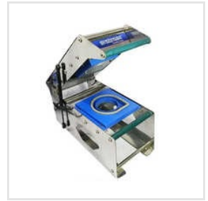
Biscuit Tray Sealing Machine