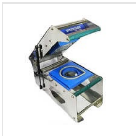
PET Glass Sealing Machine