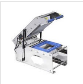
5 Portion Thali Sealing Machine