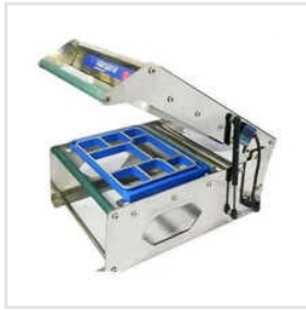
8 Cavity Tray Sealing Machine