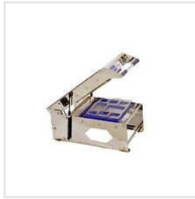
8 Portion Meal Tray Sealing Machine