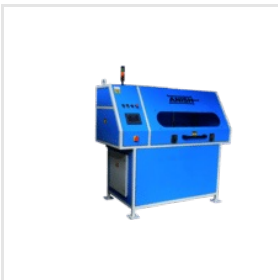
Hydraulic Hose Pipe Pressure Testing