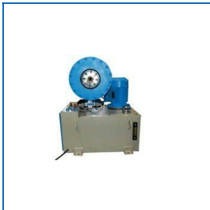
INDUSTRIAL HORIZONTAL CRIMPING MACHINE

Electric Horizontal Hose Crimping Machine, Electric Hose Skiving Machines, Heavy Duty Horizontal Crimping Machine, Horizontal Crimping Machines, Horizontal Hose Pipe Crimping Machine HZ-280, Horizontal Machine Tools Crimping Machine, Hose Cutting Machine, Hose Skiving Machine, Hydraulic Filtration System, Hydraulic Hose Pipe Pressure Testing Machine, Hydraulic Hose Skiving Crimping Machine, Hydraulic Hose Skiving Machine, Hydraulic Pipe Crimping Machine, Hydraulic Type Automatic Hose Crimping Machine, Industrial Horizontal Crimping Machine, etc.