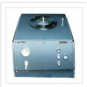
Nut Crimping Machine