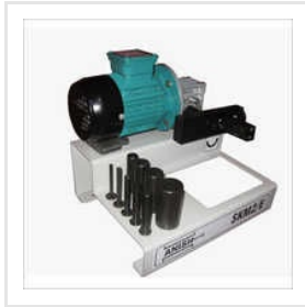
Hydraulic Hose Skiving Crimping Machine