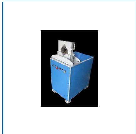
HORIZONTAL CRIMPING MACHINES