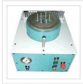
Vertical Hose Crimping Machine