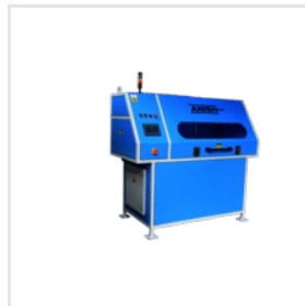
Pressure Testing Equipment