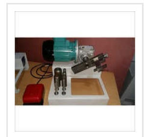
Electric Hose Skiving Machines