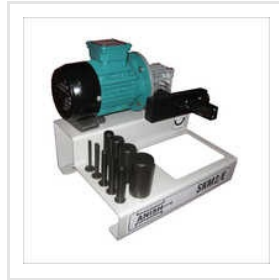
Hose Skiving Machine