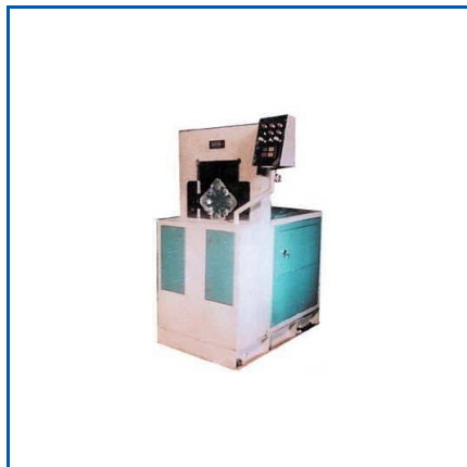
HEAVY DUTY HORIZONTAL CRIMPING MACHINE