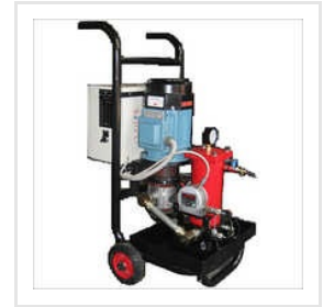
Hydraulic Filtration System