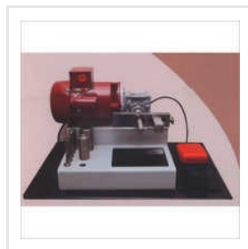
Hydraulic Hose Skiving Machine