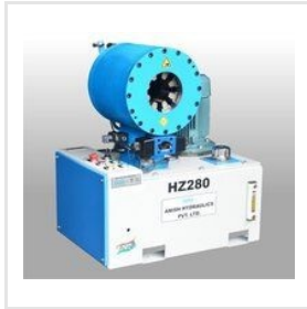
Horizontal Hose Pipe Crimping Machine HZ-