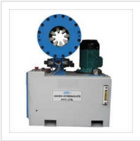
Hydraulic Type Automatic Hose