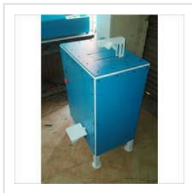
Hose Cutting Machine