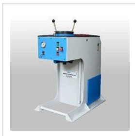
Vertical Crimping Machine