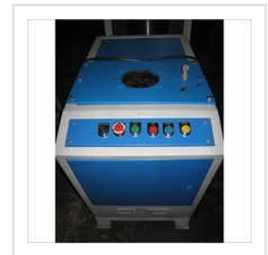
Nut Crimping Machine AC-70N