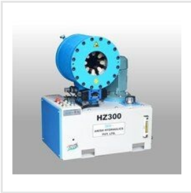
Hydraulic Pipe Crimping Machine