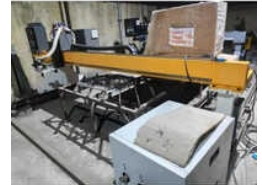
Single Phase CNC Gantry Profile Cutting