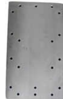
MS Plate Cutting Services