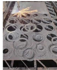
Sheet Metal Cutting Service