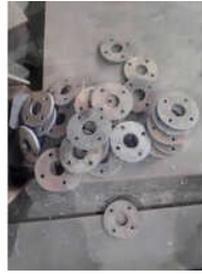
CNC Profile Cutting Services