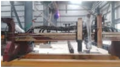
CNC Machine Maintenance Service