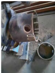
CNC PIPE PROFILE CUTTING SERVICES

CNC Gas Cutting Services, CNC Machine Maintenance Service, CNC Pipe Profile Cutting Services, CNC Profile Cutting Services, Commercial ZW CAD Software Service, Industrial CNC Plasma Cutting Services, MS CNC Plasma Cutting Machine, MS Plate Cutting Services, MS Profile Cutting Services, Oxy Fuel CNC Cutting Machine, Portable CNC Profile Cutting Machine, etc.