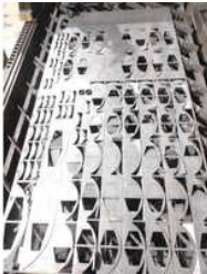
Steel Cutting Services