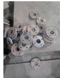
CNC PROFILE CUTTING SERVICES