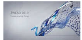
Commercial ZW CAD Software Service