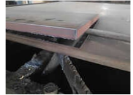
CNC Gas Cutting Services