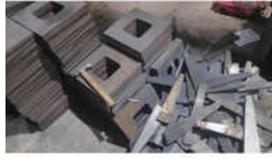
Industrial CNC Plasma Cutting Services