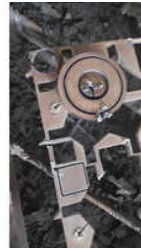
Stainless Steel Sheet Cutting Services