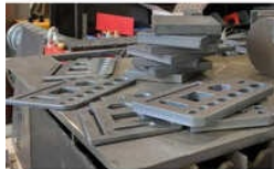
MS Profile Cutting Services