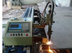
Portable CNC Profile Cutting Machine