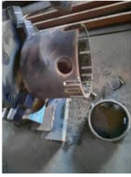
CNC Pipe Profile Cutting Services