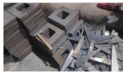
INDUSTRIAL CNC PLASMA CUTTING SERVICES