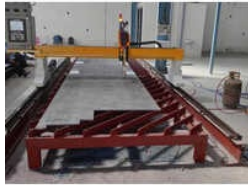
Oxy Fuel CNC Cutting Machine